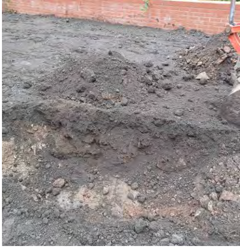
PLOT 31 INSPECTION PIT