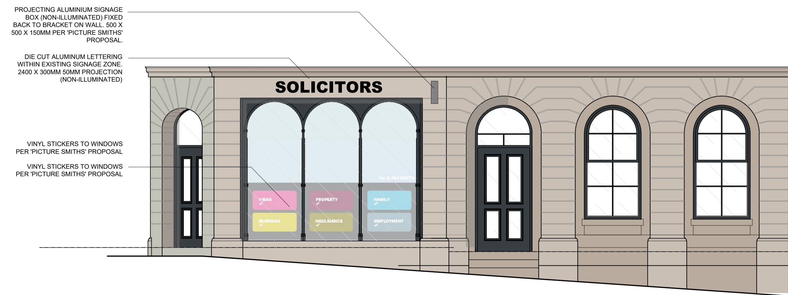
NORTHUMBERLAND STREET ELEVATION