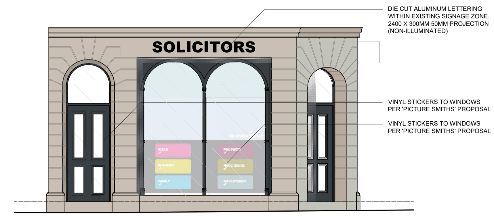
JOHN WILLIAM STREET ELEVATION