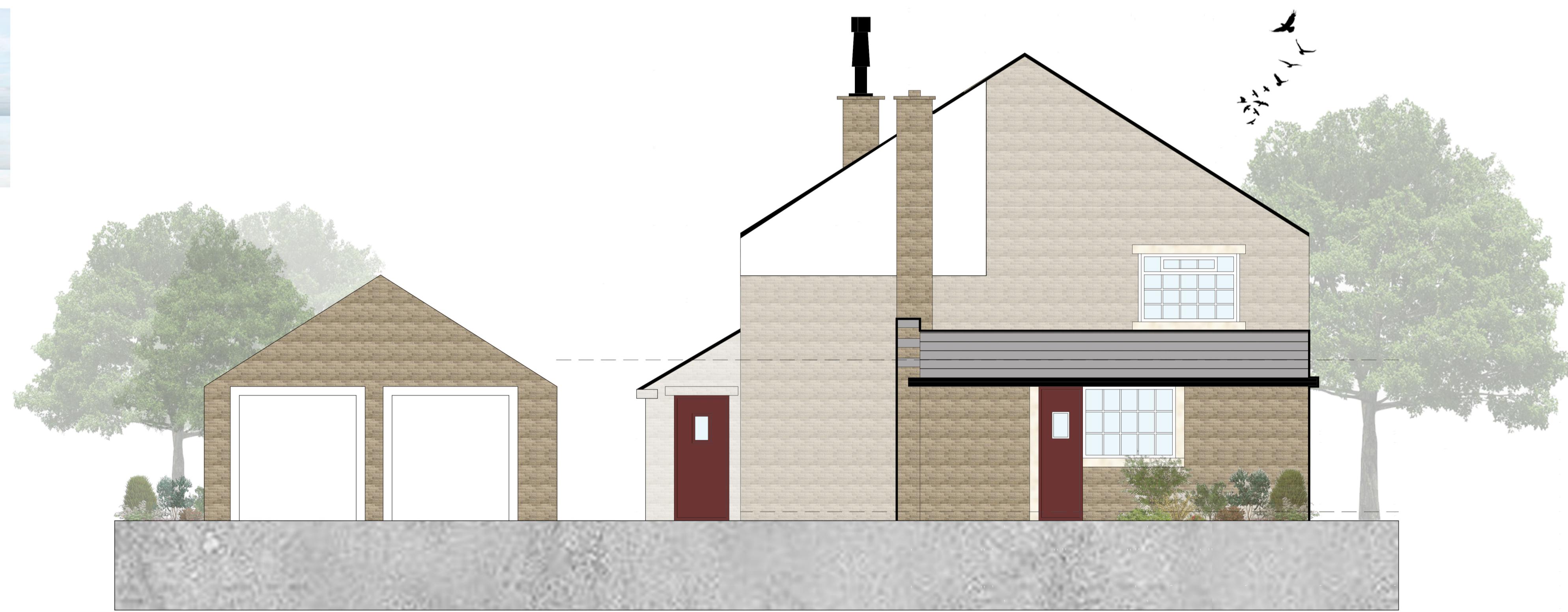
SIDE ELEVATION_ AS EXISTING_ Scale 1_50