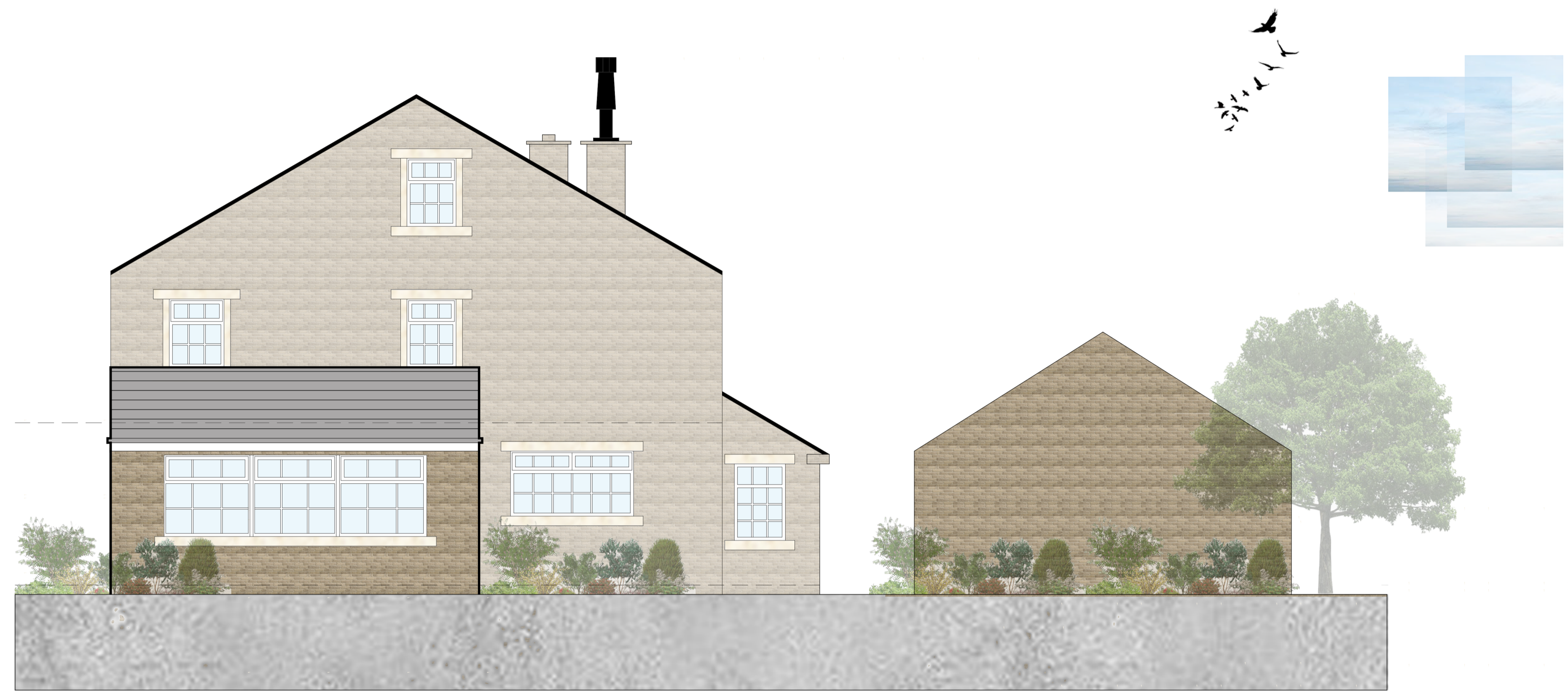
SIDE ELEVATION_ AS EXISTING_ Scale 1_50

Note: Information is based on OS map and received information and is subject to full topographical survey. Assumed site boundary and site constraints subject to legal confirmation. All Legal easements and extent of existing underground services locations are subject to confirmation.