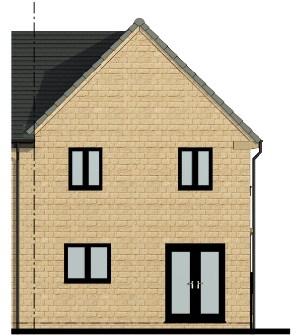
L.H. SIDE ELEVATION.