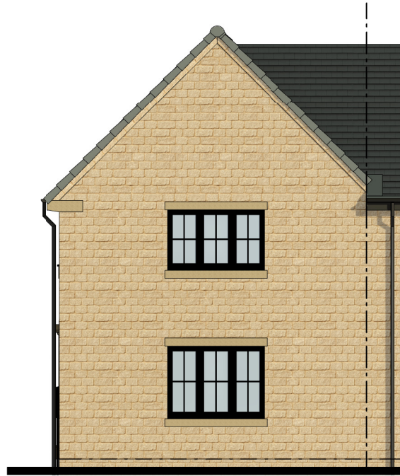
R.H. SIDE ELEVATION.