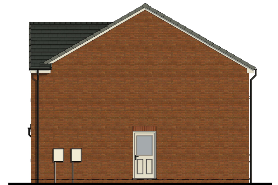
R.H. SIDE ELEVATION.