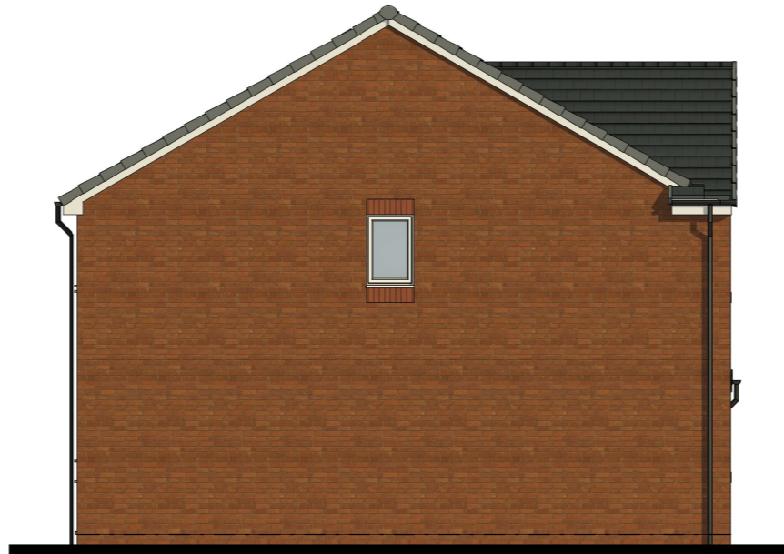
L.H. SIDE ELEVATION.