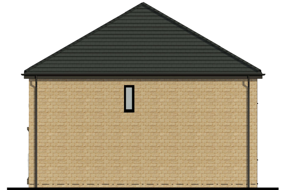
R.H. SIDE ELEVATION.

* OPTIONAL WINDOW POSITIONS FOR ALTERNATIVE HANDING.