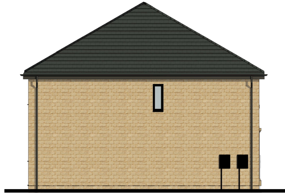
L.H. SIDE ELEVATION.