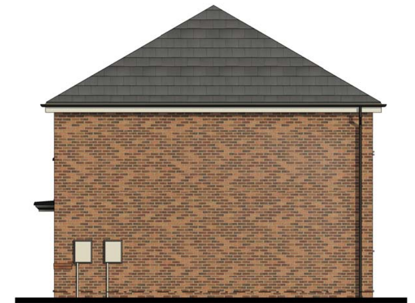
R.H. SIDE ELEVATION.