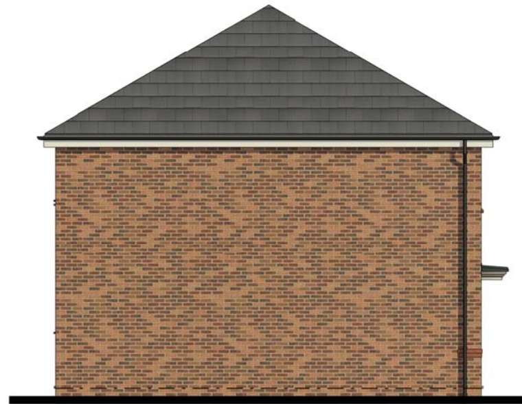
L.H. SIDE ELEVATION.