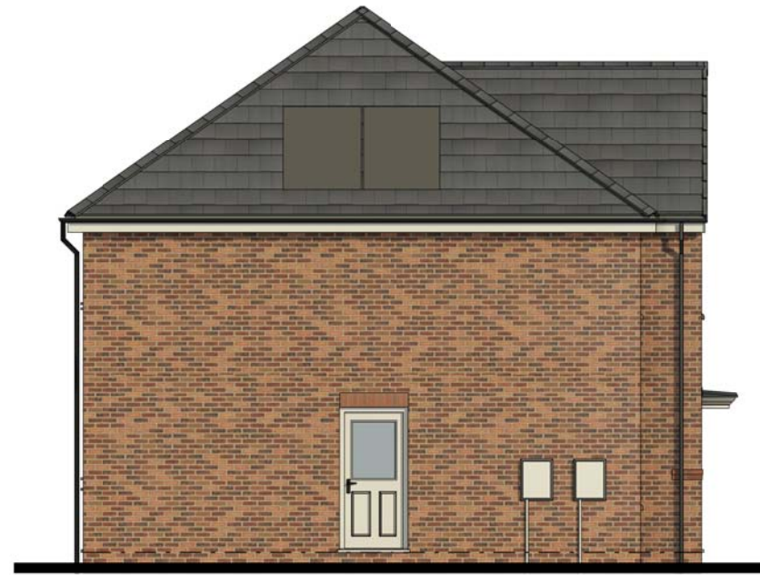
L.H. SIDE ELEVATION.