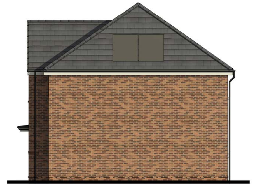
R.H. SIDE ELEVATION.