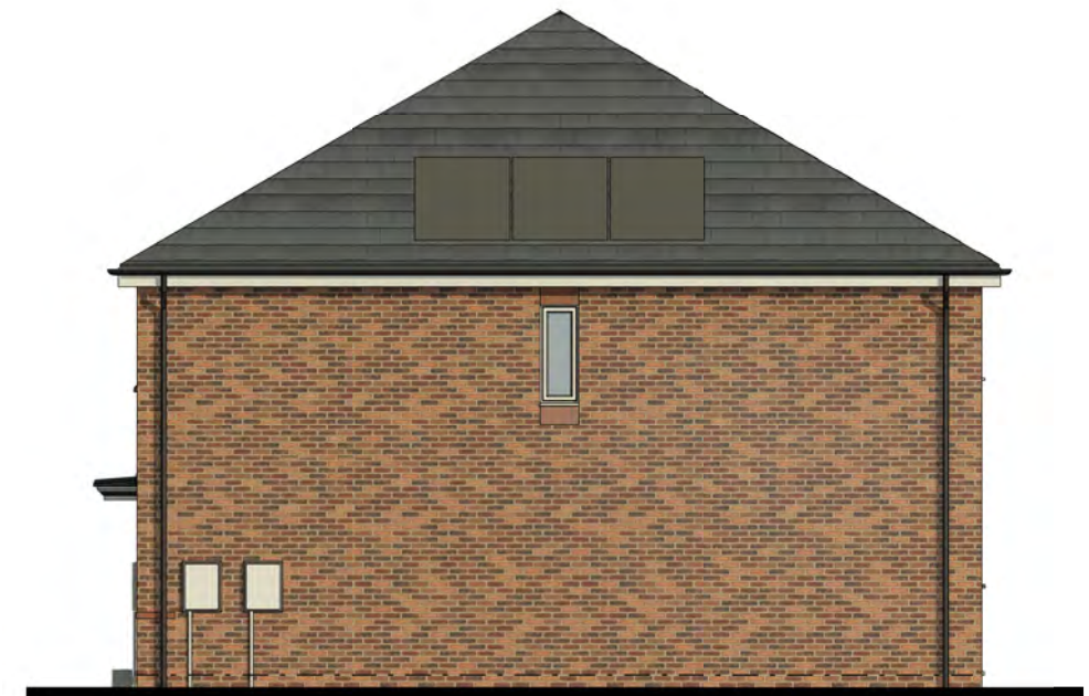
R.H. SIDE ELEVATION.

* INDICATES OPTIONAL WINDOW POSITIONS FOR ALTERNATIVE HANDING.