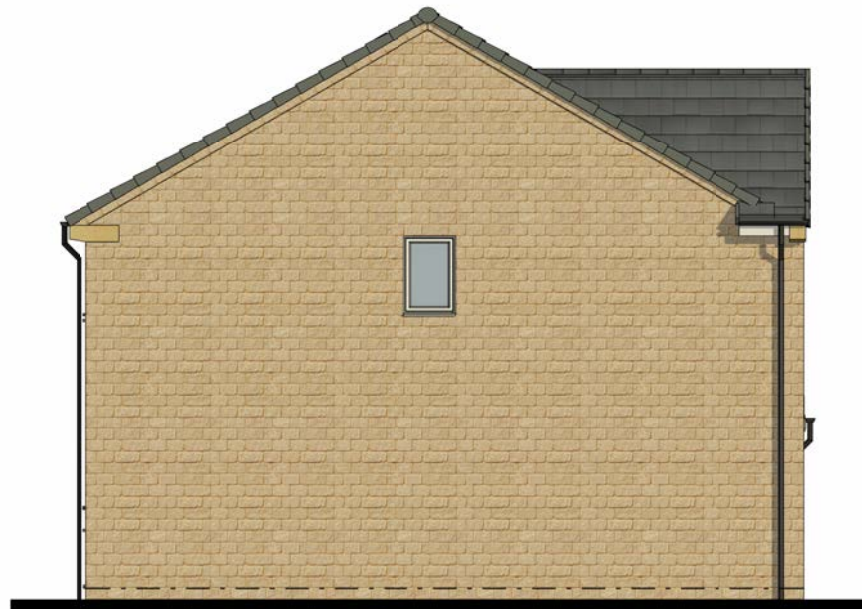
L.H. SIDE ELEVATION.