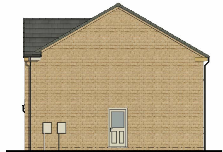
R.H. SIDE ELEVATION.