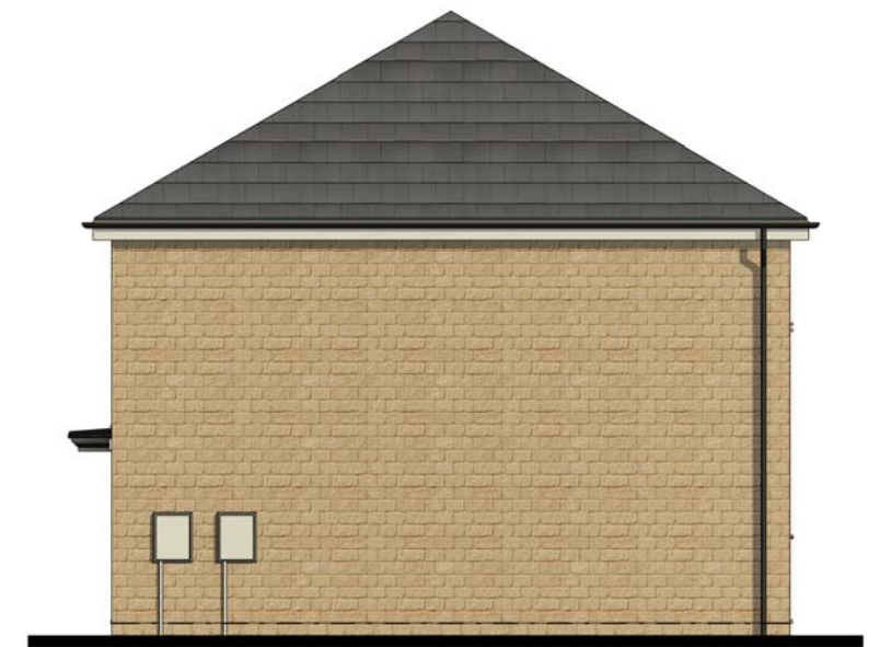
R.H. SIDE ELEVATION.