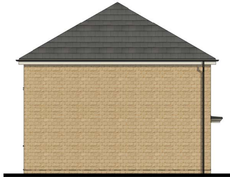
L.H. SIDE ELEVATION.