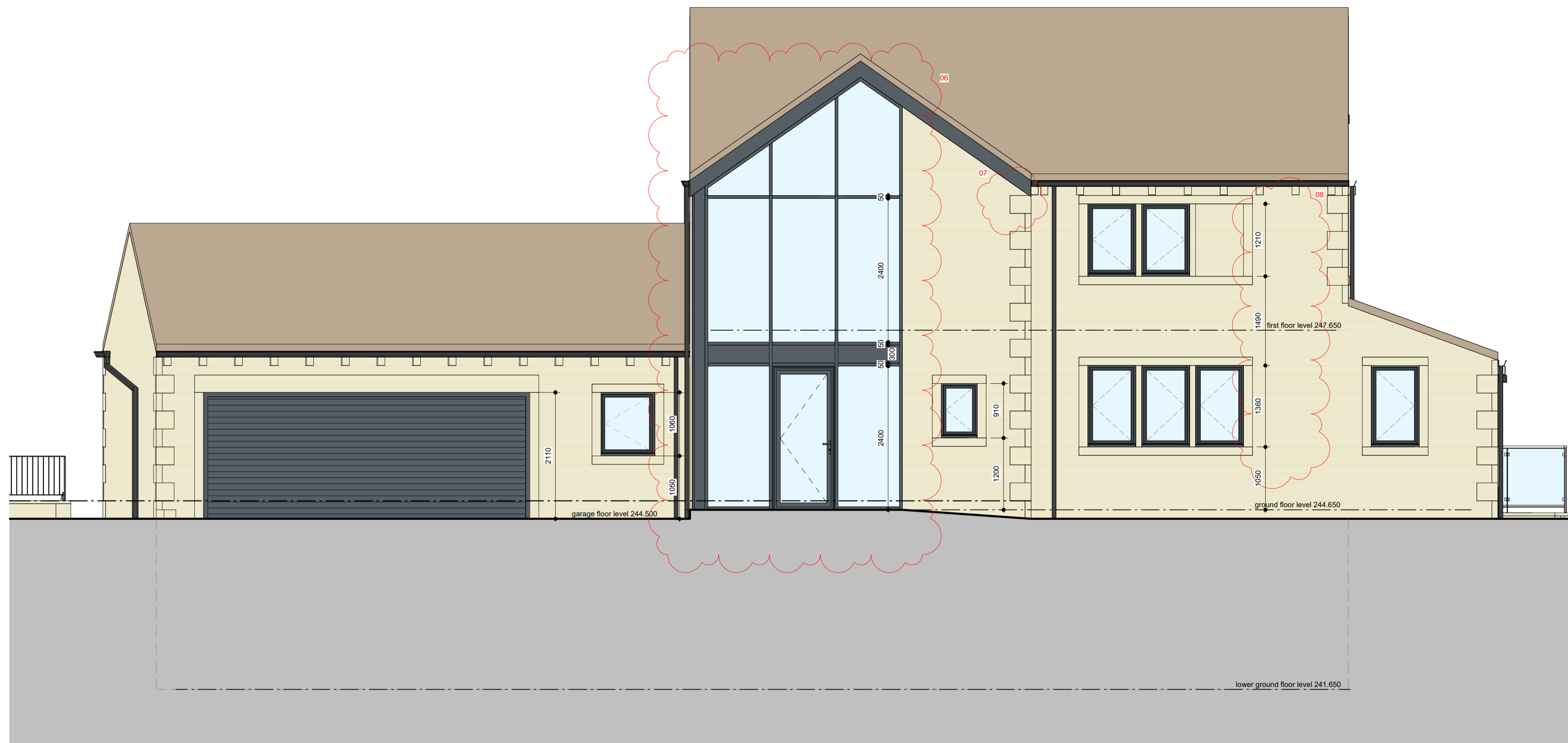
north elevation (front) 1 : 50