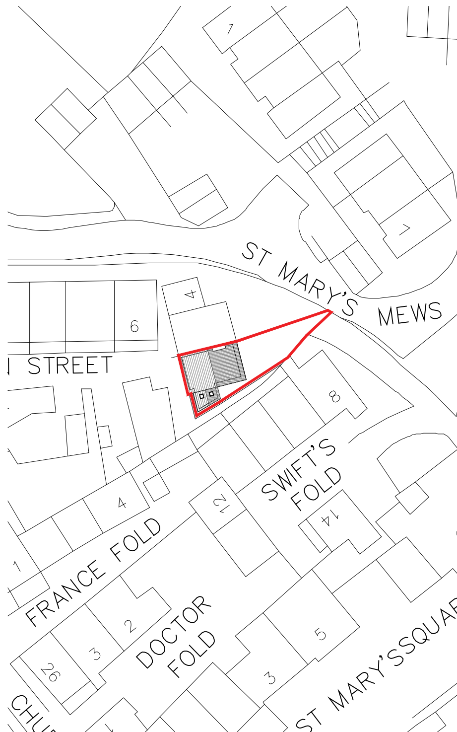
SITE PLAN_ AS EXISTING + PROPOSED