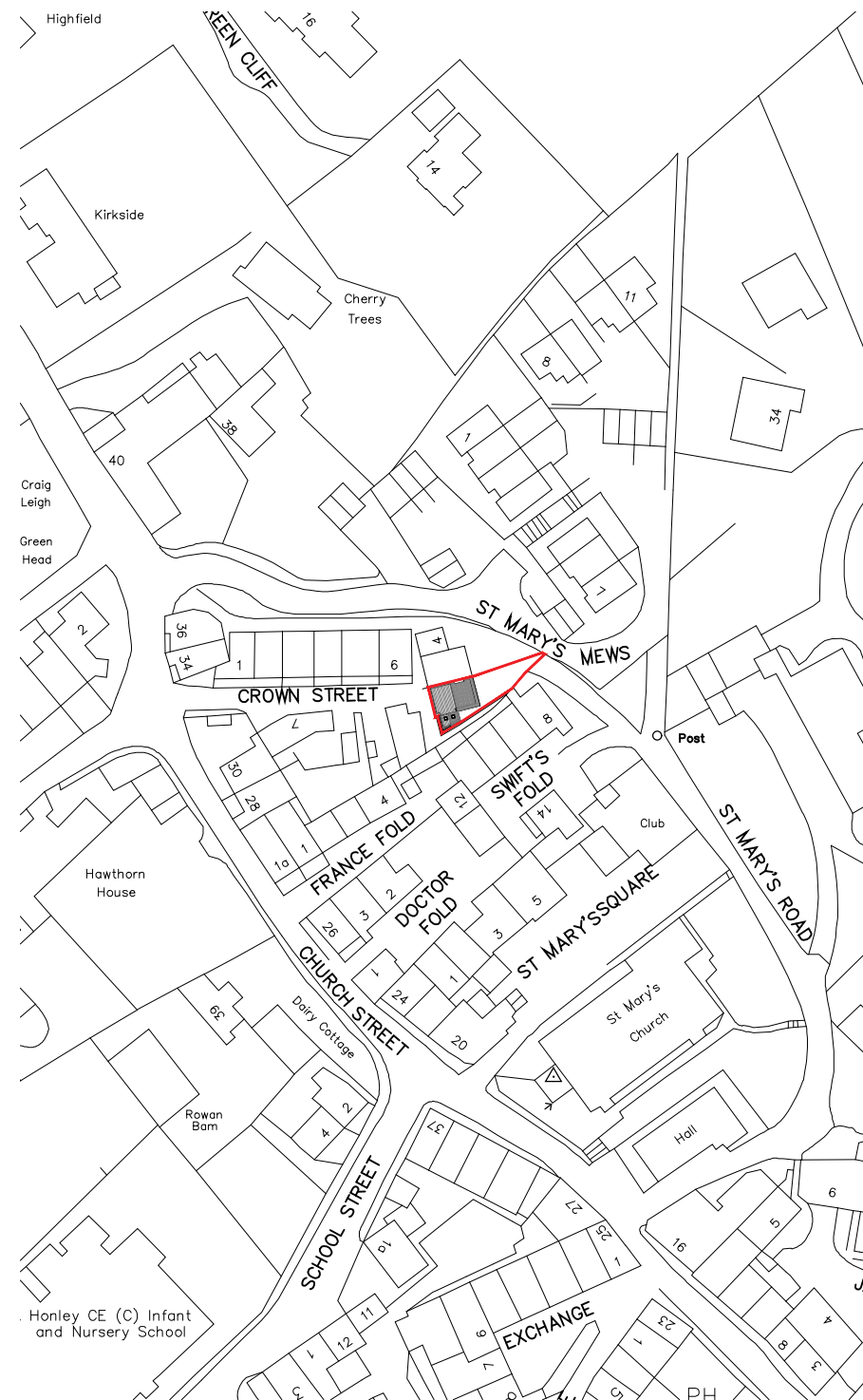
LOCATION PLAN_ AS EXISTING + PROPOSED