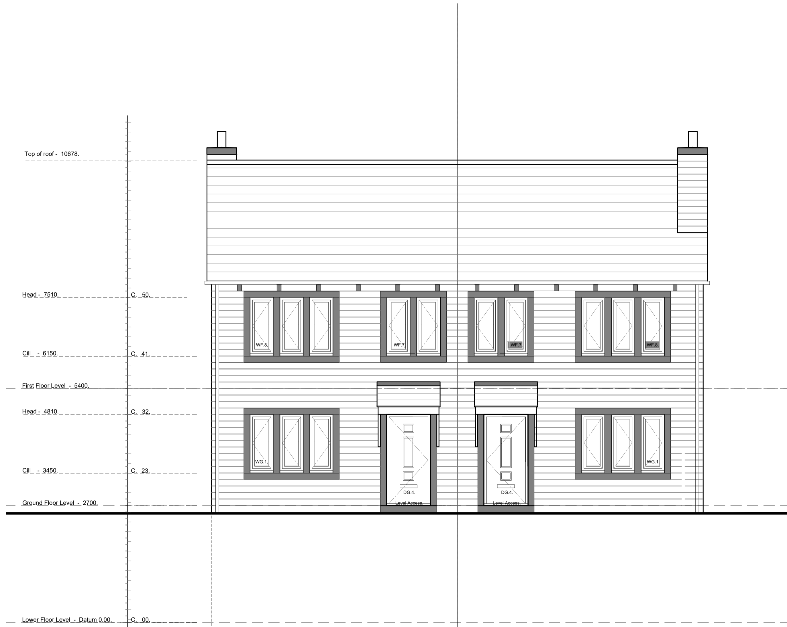
Plot 4. Front Elevation.

The building owner is to serve a Party Wall Act Notice as applicable to adjoining property owners as outlined in The Party Wall Act 1996. The Building Contractor is to verify the thickness of the party walls prior to commencement of the proposed works.