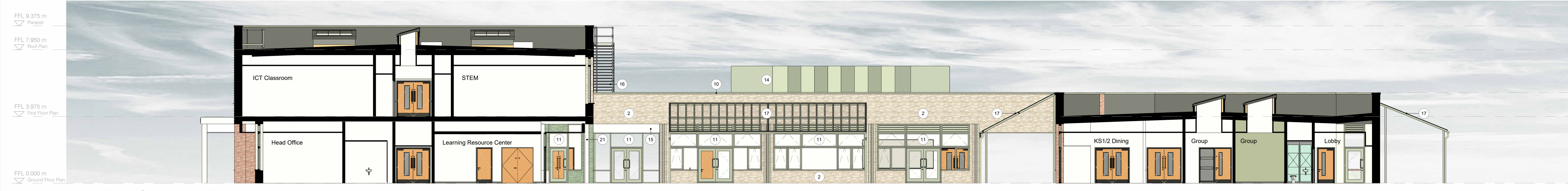
3 West Courtyard Elevation 1 : 100