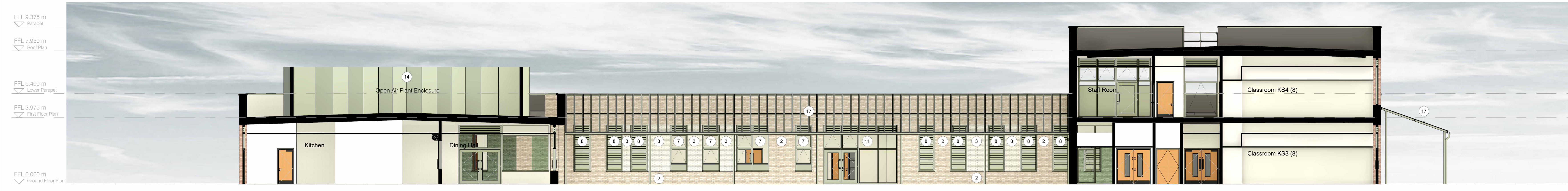
4 North Courtyard Elevation 1 : 100