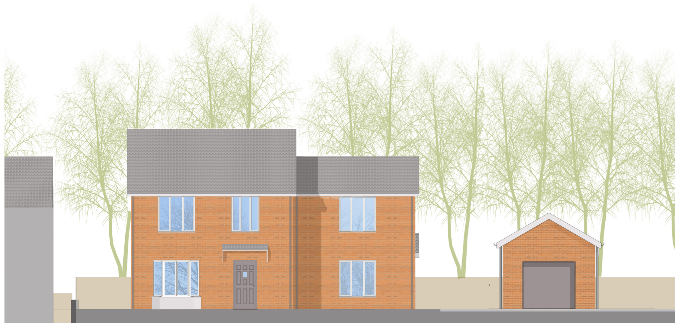
1 Front Elevation - North East