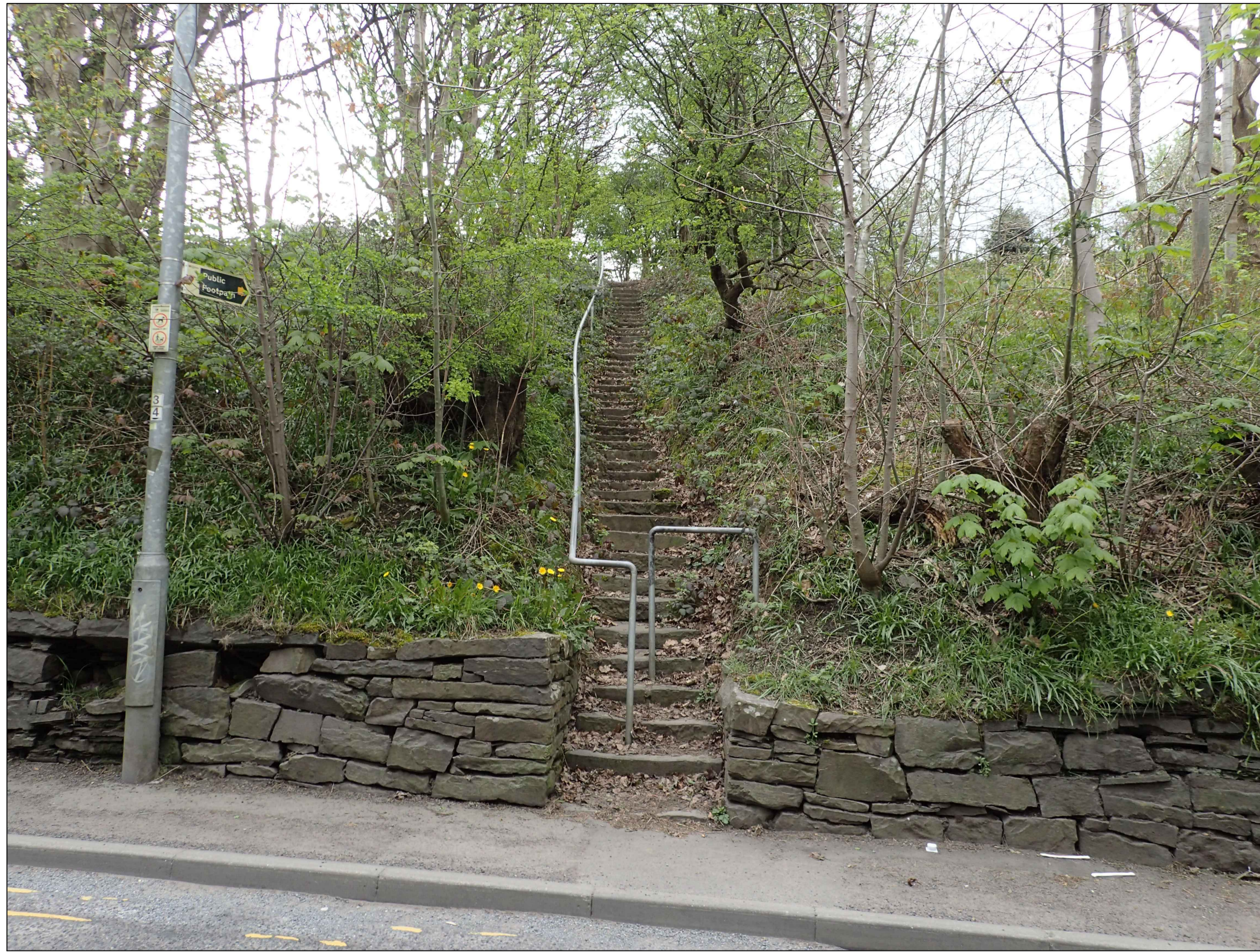
Existing step arrangement