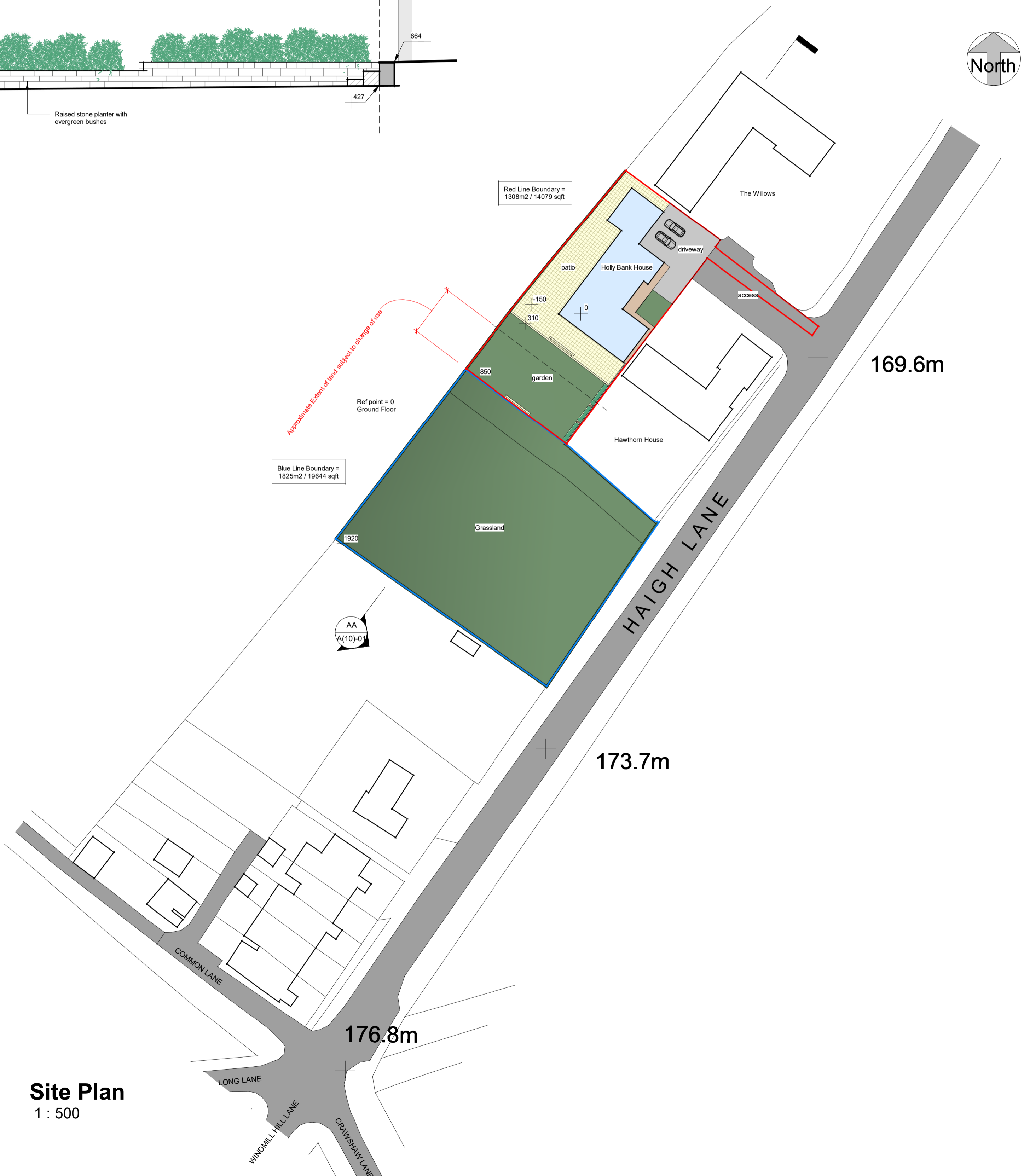
Site Plan 1 : 500