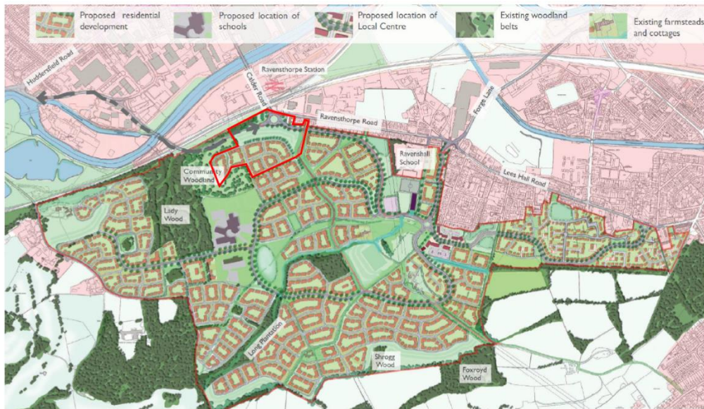
Figure 5-1: DRMF layout with Site outlined in red