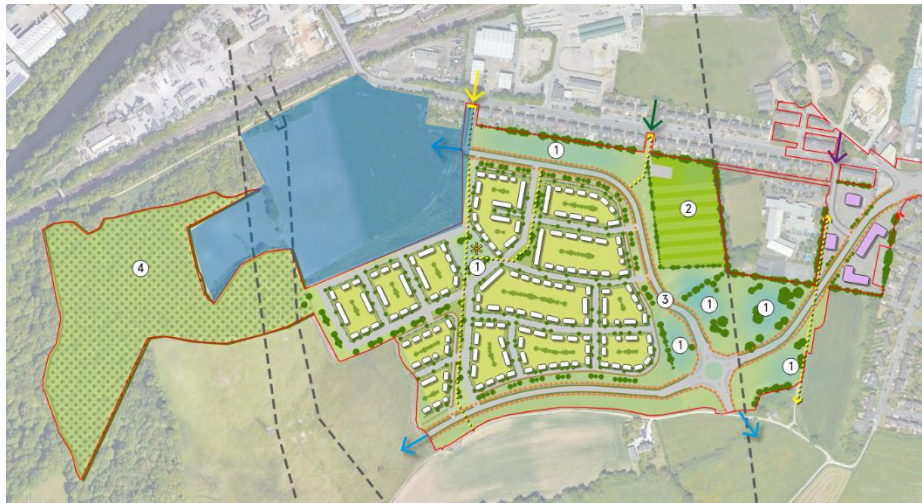
Figure 3-3: Kirklees Council HPP with the Site shaded in blue.

3.5 The illustrative masterplan layout is shown in Figure 3-3 for context.