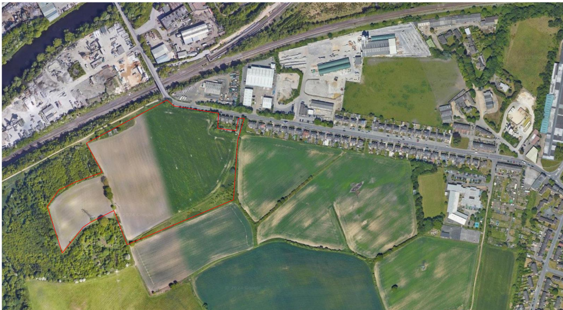
Figure 2-1: Site location with the Site outlined in red.