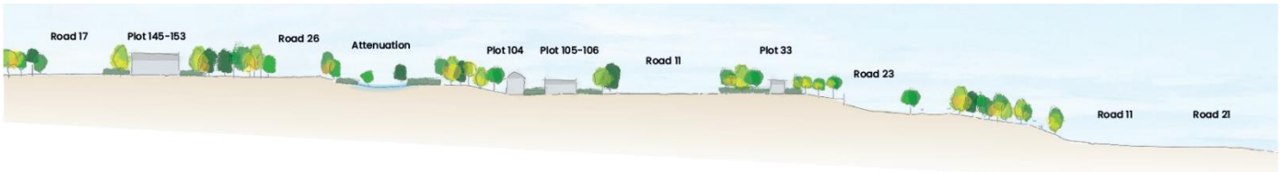
Figure 6-2: West to east section across the Site.

6.8 There are significant level changes across the Site. The illustrative layout has shown how this could be sensitively addressed through the location of road and public open space, as shown in Figure 6-2 below.