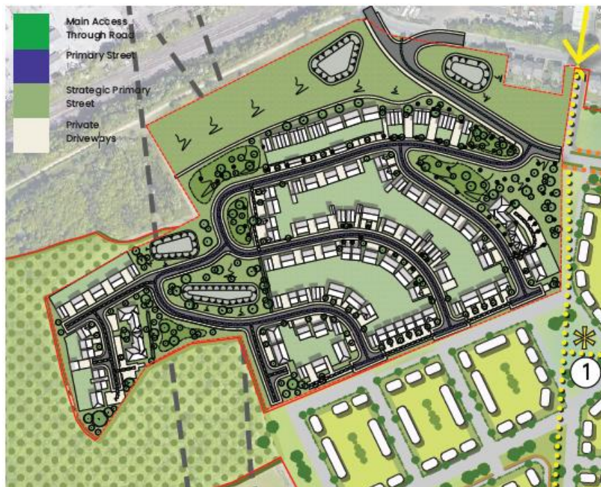
Figure 6-3: Proposed road hierarchy.

6.9 The four arm roundabout shown in DRMF would not be required until at earliest c.2,000 dwellings. Therefore, the illustrative layout shown in Figure 6-3 includes a realignment of Ravensthorpe Road.