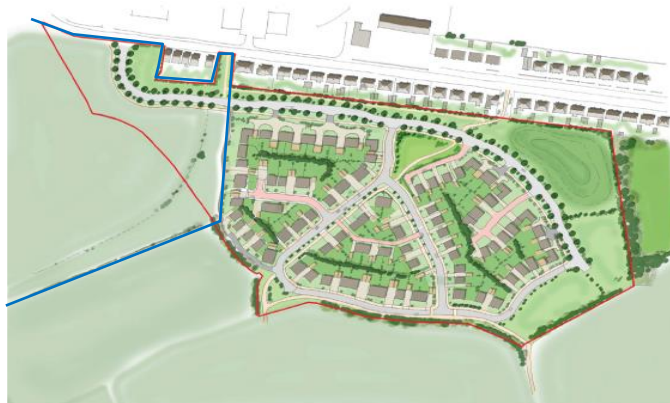
Figure 3-2: OPP Masterplan with the Site outlined in blue.