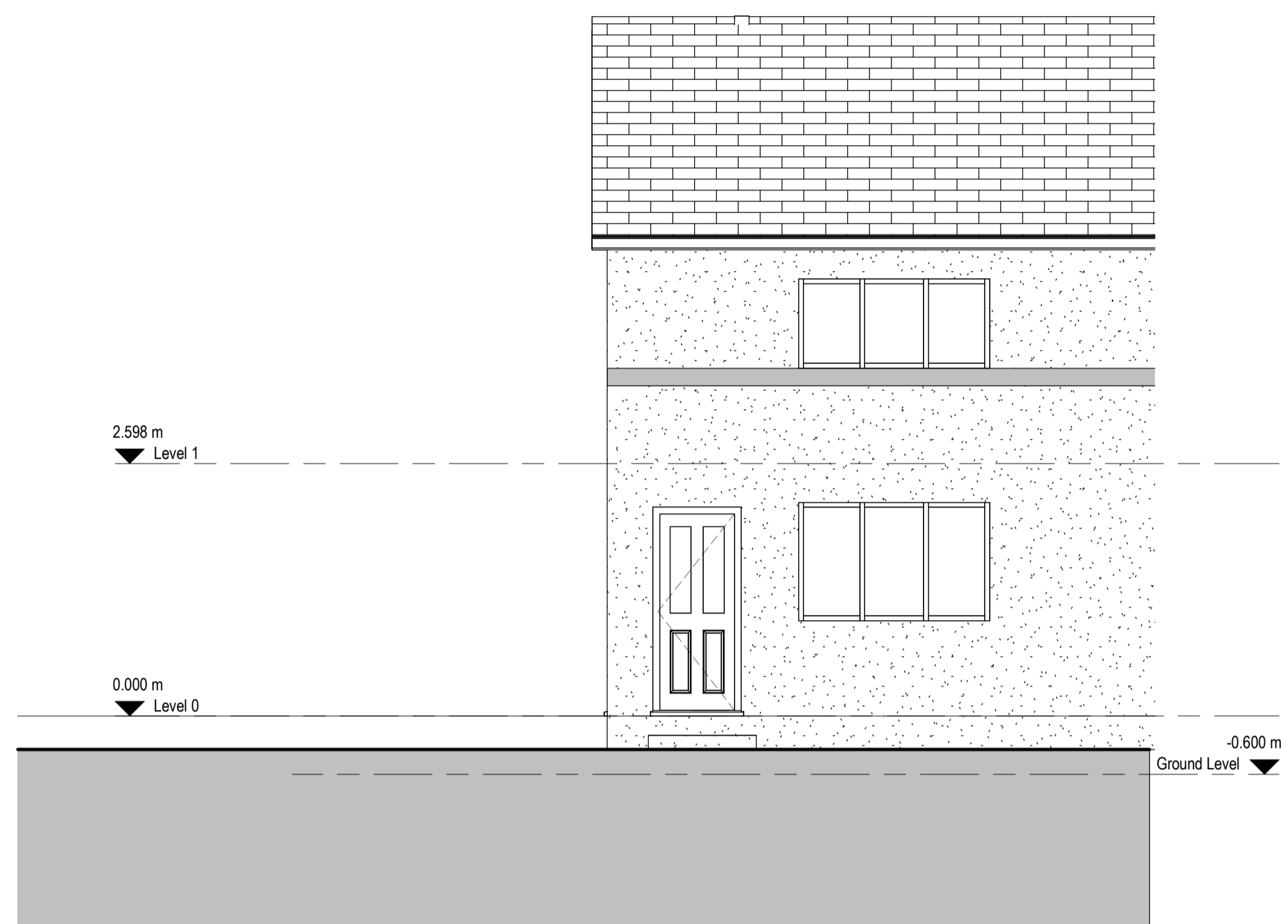
1 Front Elevation 1 : 50