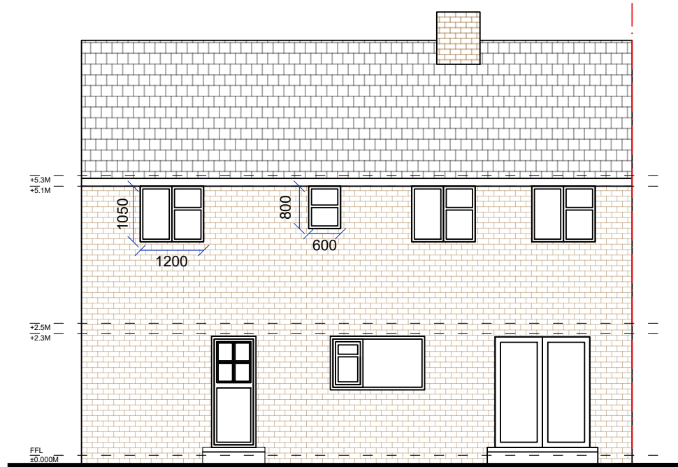
PROPOSED REAR ELEVATION Facing North-East 1:100 @ A3