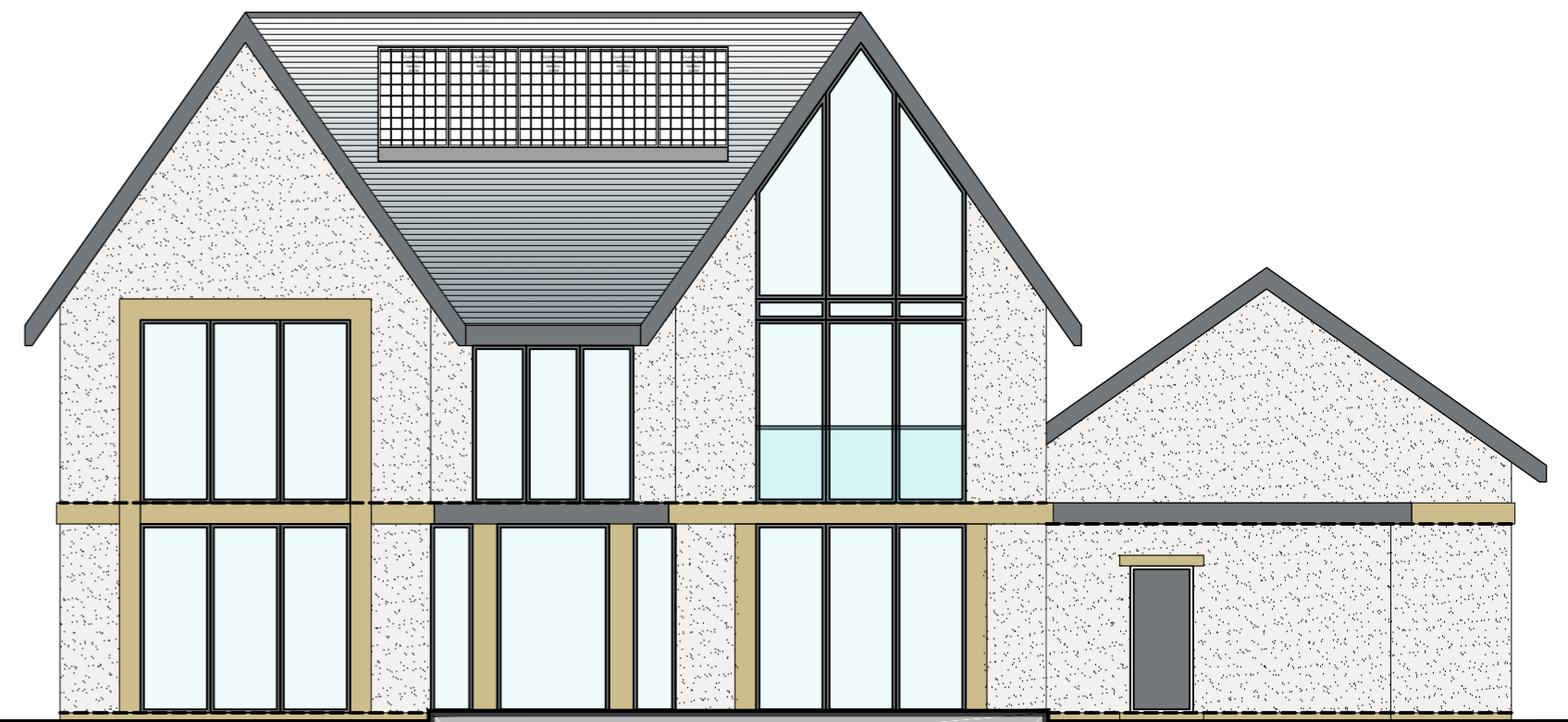
PROPOSED REAR ELEVATION. 1:100