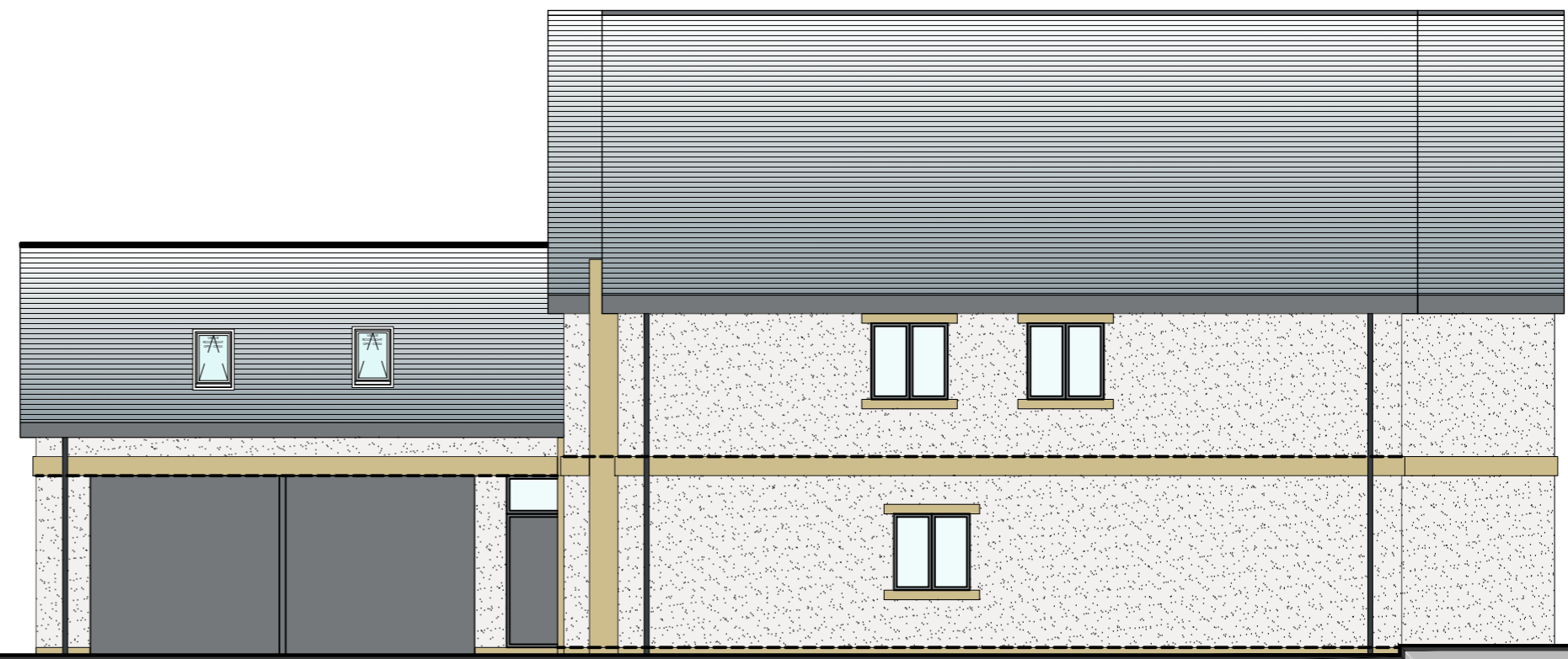
PROPOSED SIDE ELEVATION. 1:100