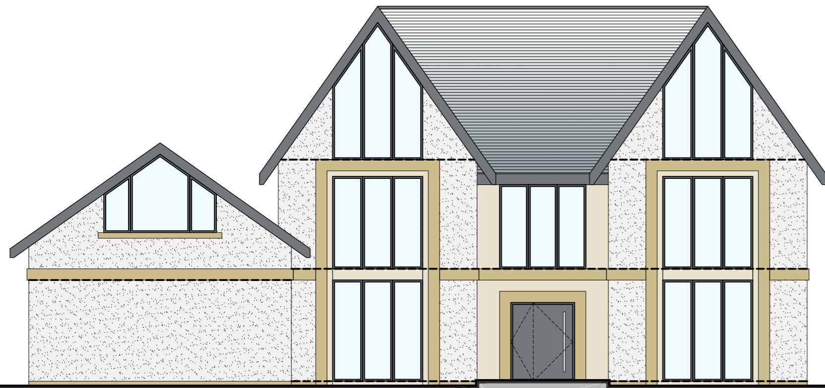
PROPOSED FRONT ELEVATION. 1:100