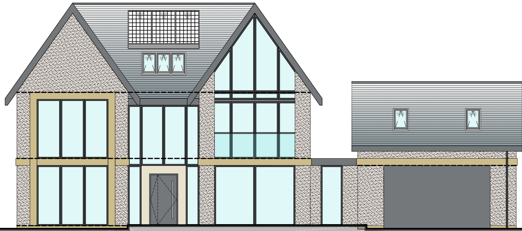
PROPOSED FRONT ELEVATION. 1:100