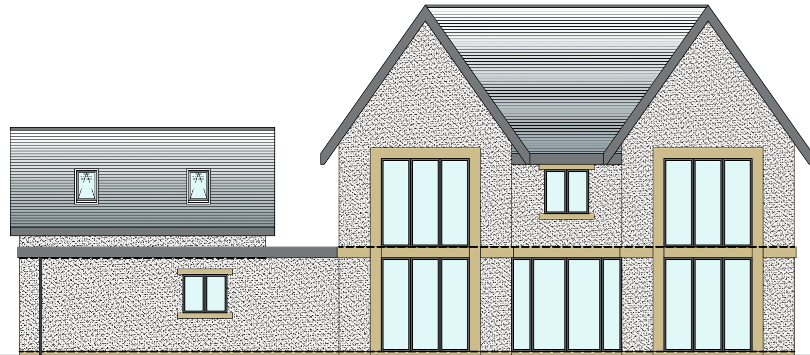
PROPOSED REAR ELEVATION. 1:100