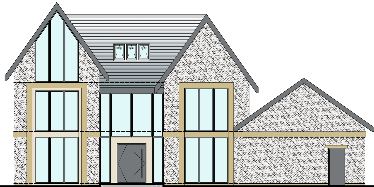
PROPOSED FRONT ELEVATION. 1:100