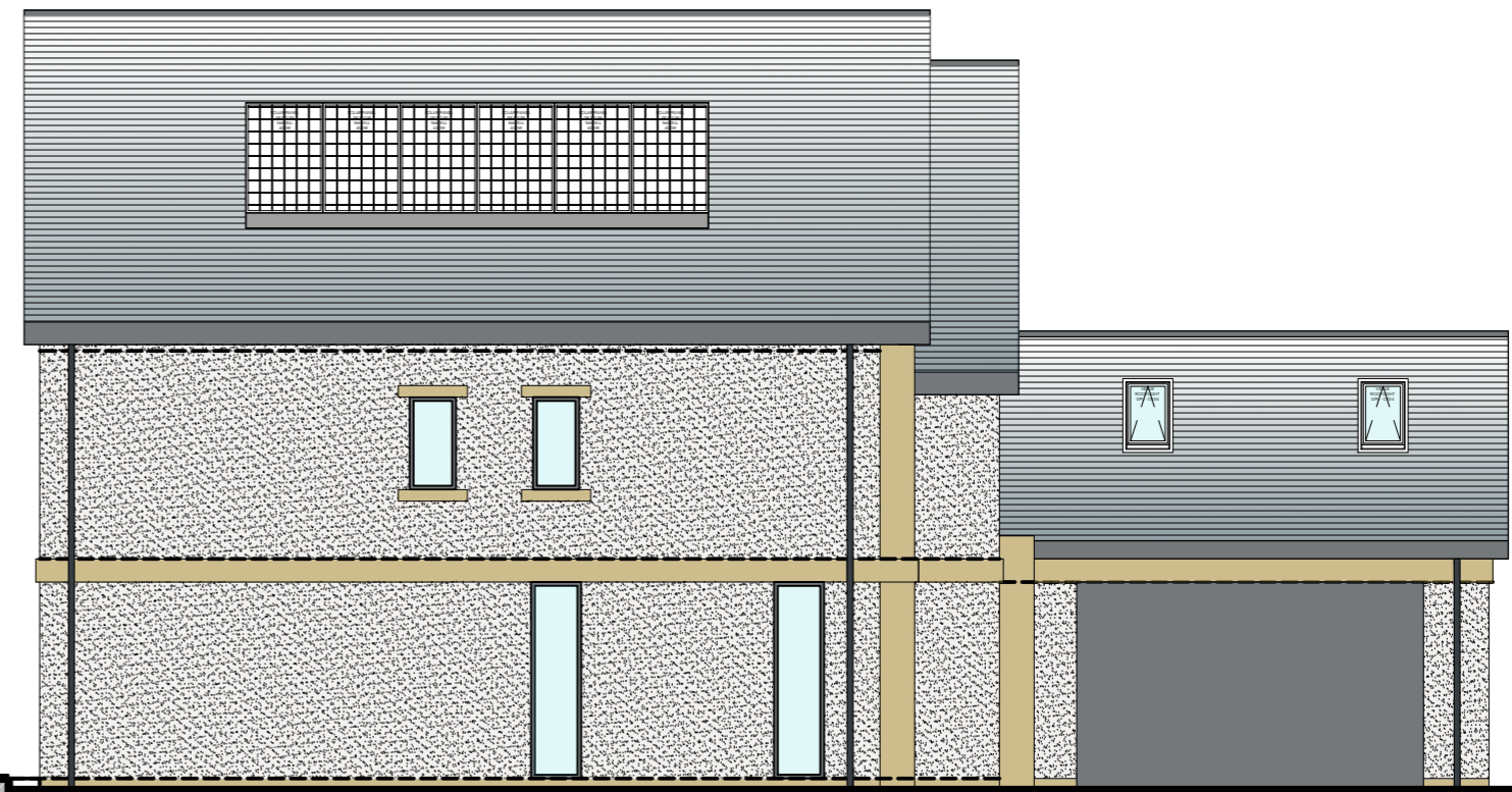
PROPOSED SIDE ELEVATION. 1:100