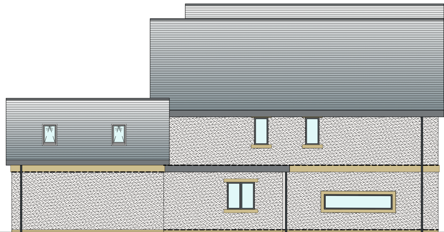
PROPOSED SIDE ELEVATION. 1:100