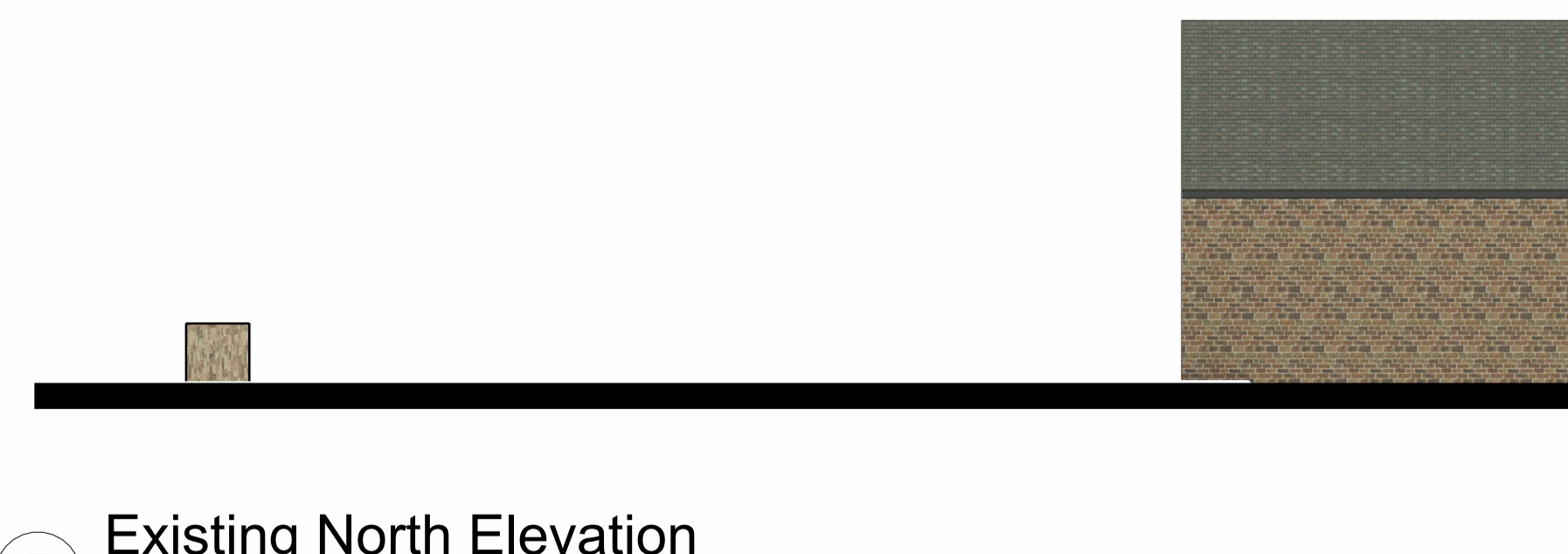
5 Existing North Elevation 1 : 100