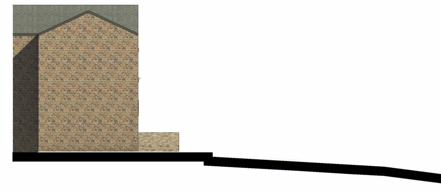
4 Existing West Elevation 1 : 100