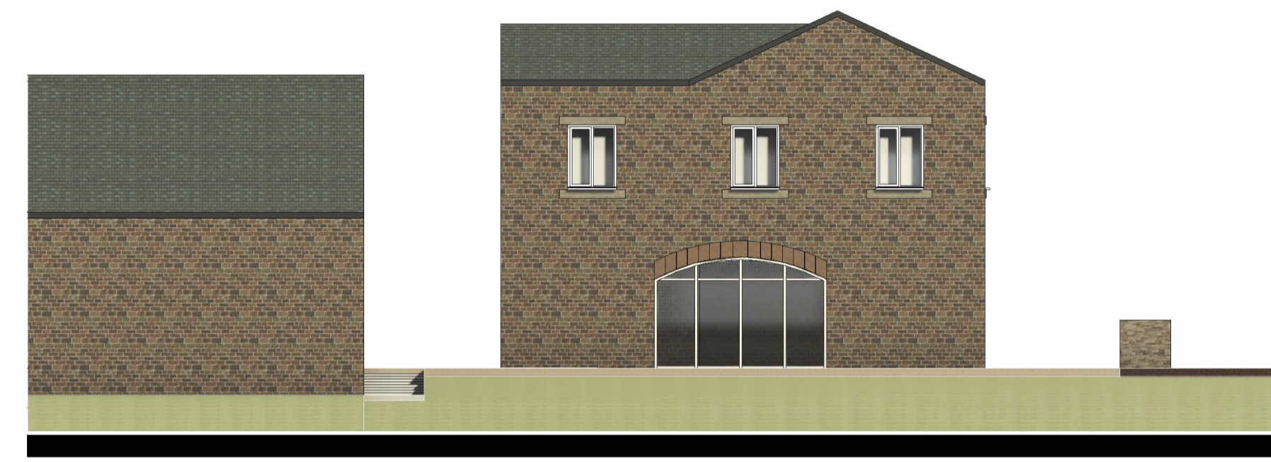
3 Existing South Elevation 1 : 100