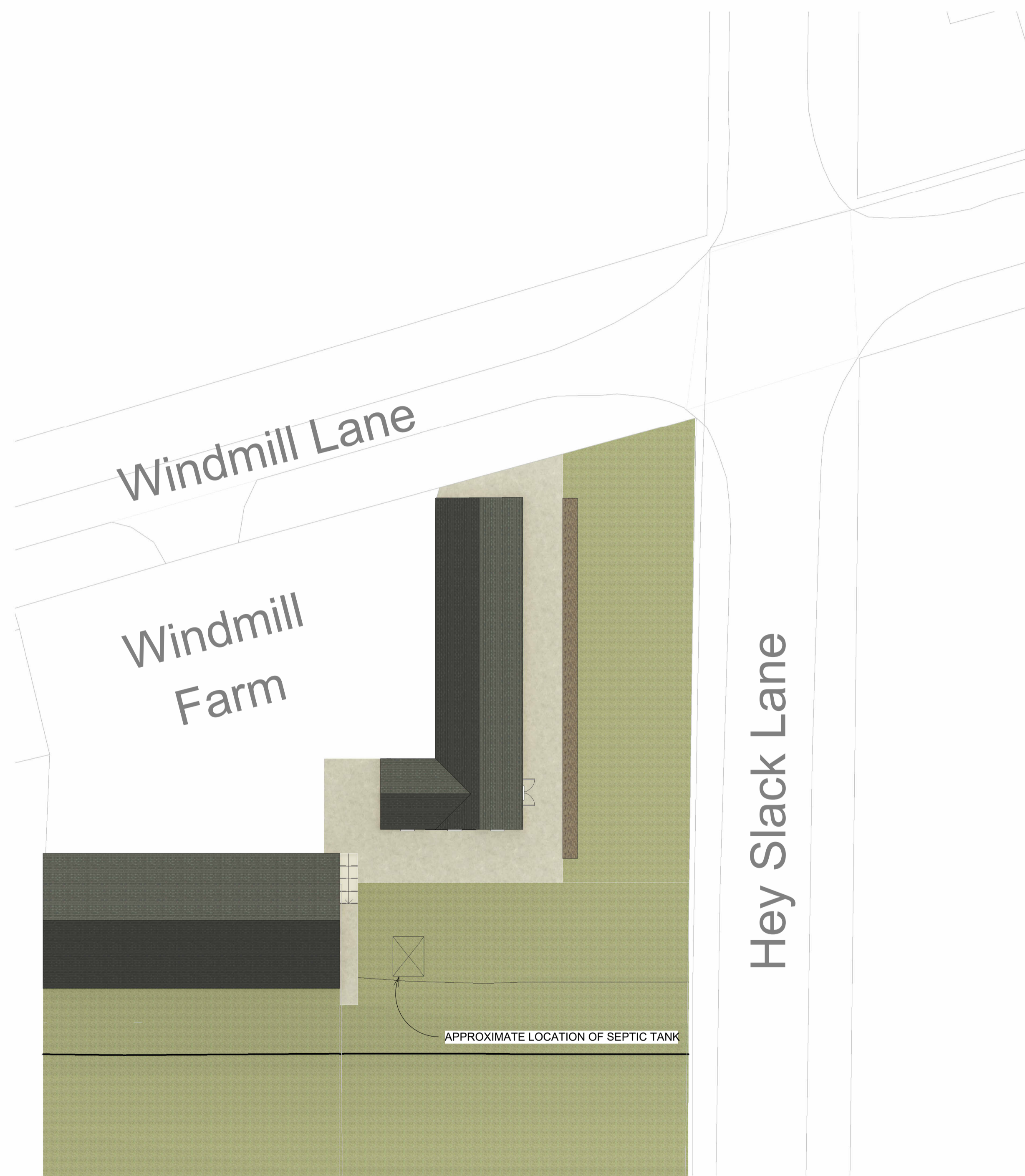
1 Existing Site 1 : 200

Only figured dimensions should be used. Scaled dimensions should be checked with the Architect. This drawing together with the design, is the property and copyright of the Architect and must not be reproduced without written permission