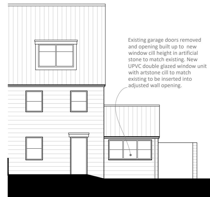
2 FRONT ELEVATION AS PROPOSED SCALE 1:100