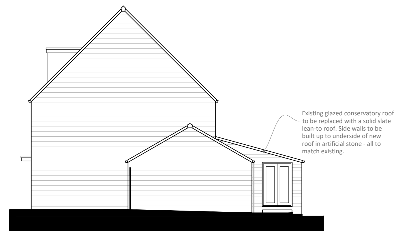
3 SIDE ELEVATION AS PROPOSED SCALE 1:100