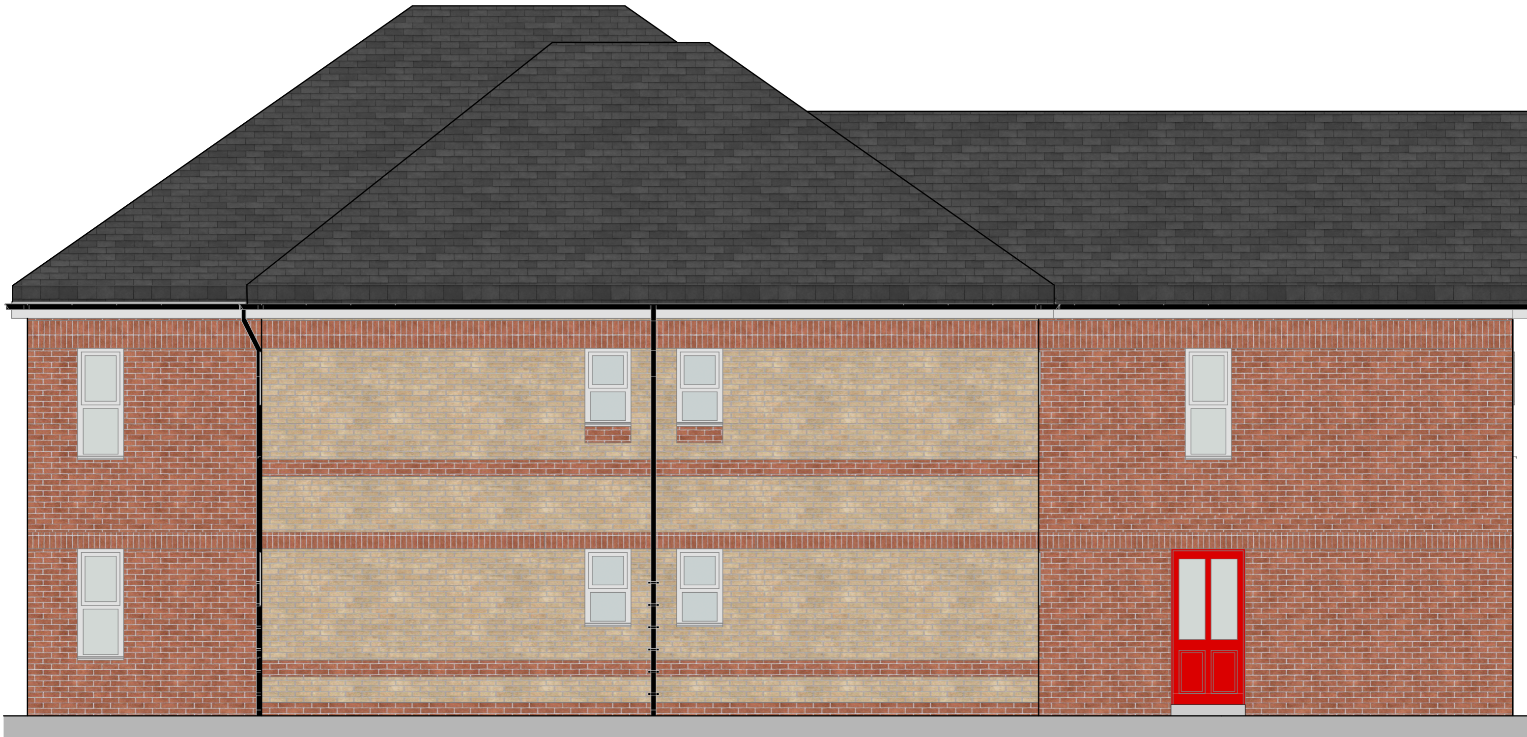
EXISTING FRONT ELEVATION (BLOCK B) 1:50@A3