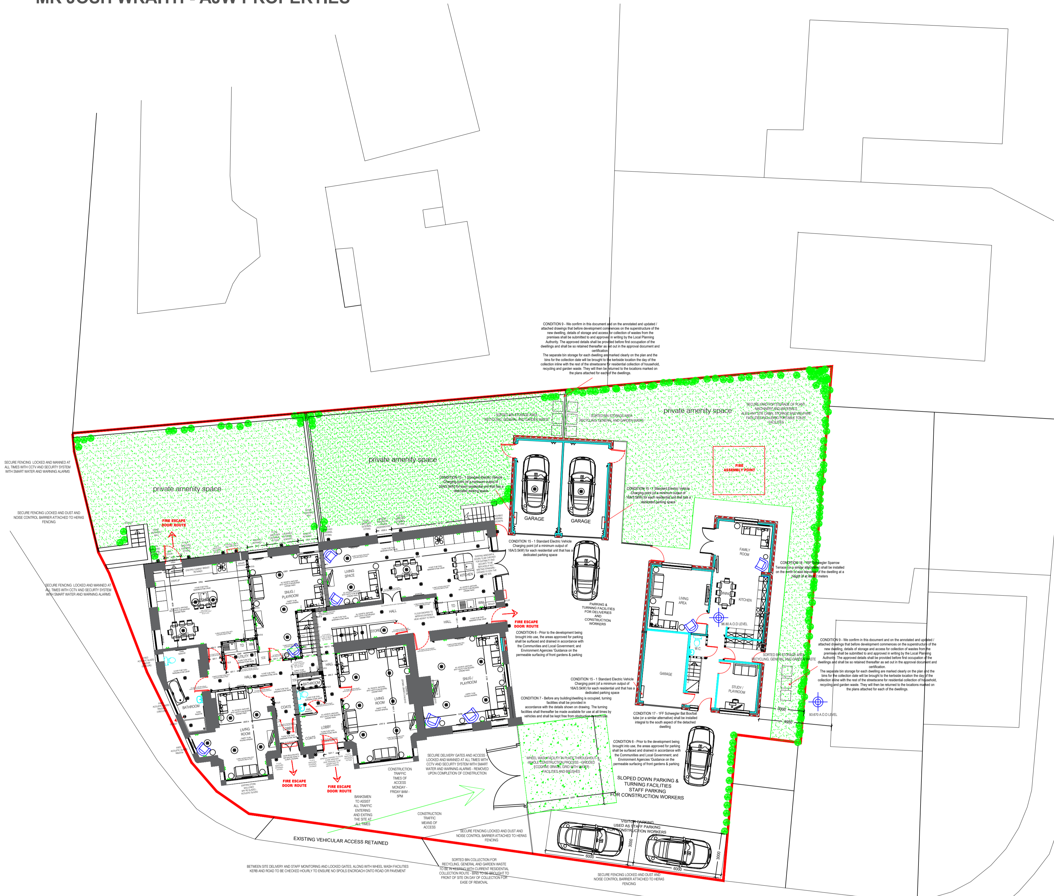
Proposed Ground Floor Plan on Site Plan Showing conditional discharge detailing