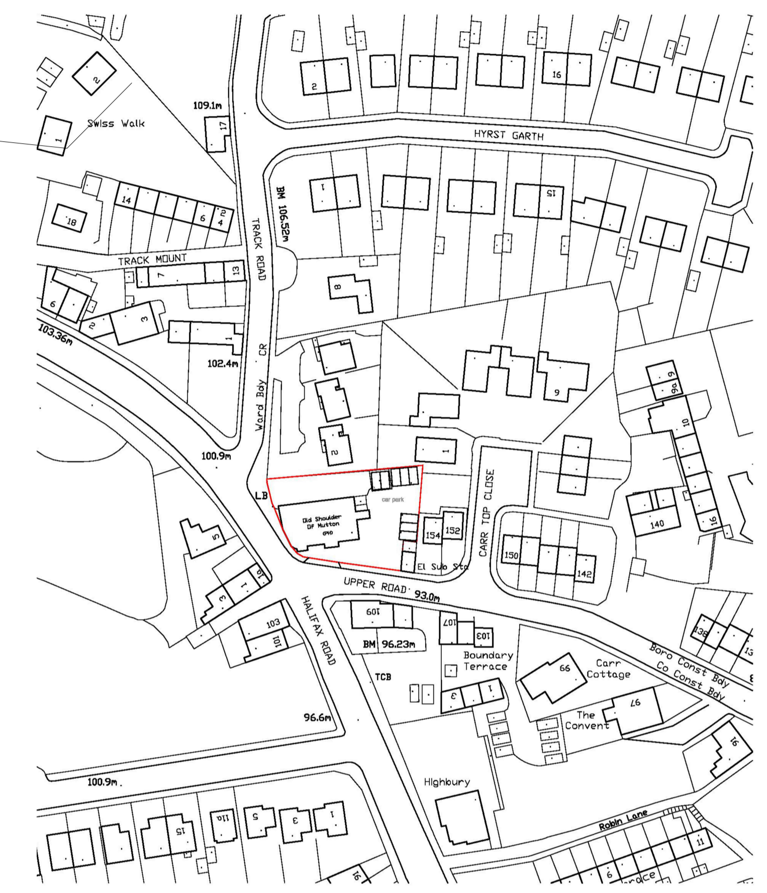
SITE LOCATION PLAN @ 1:1250 SCALE