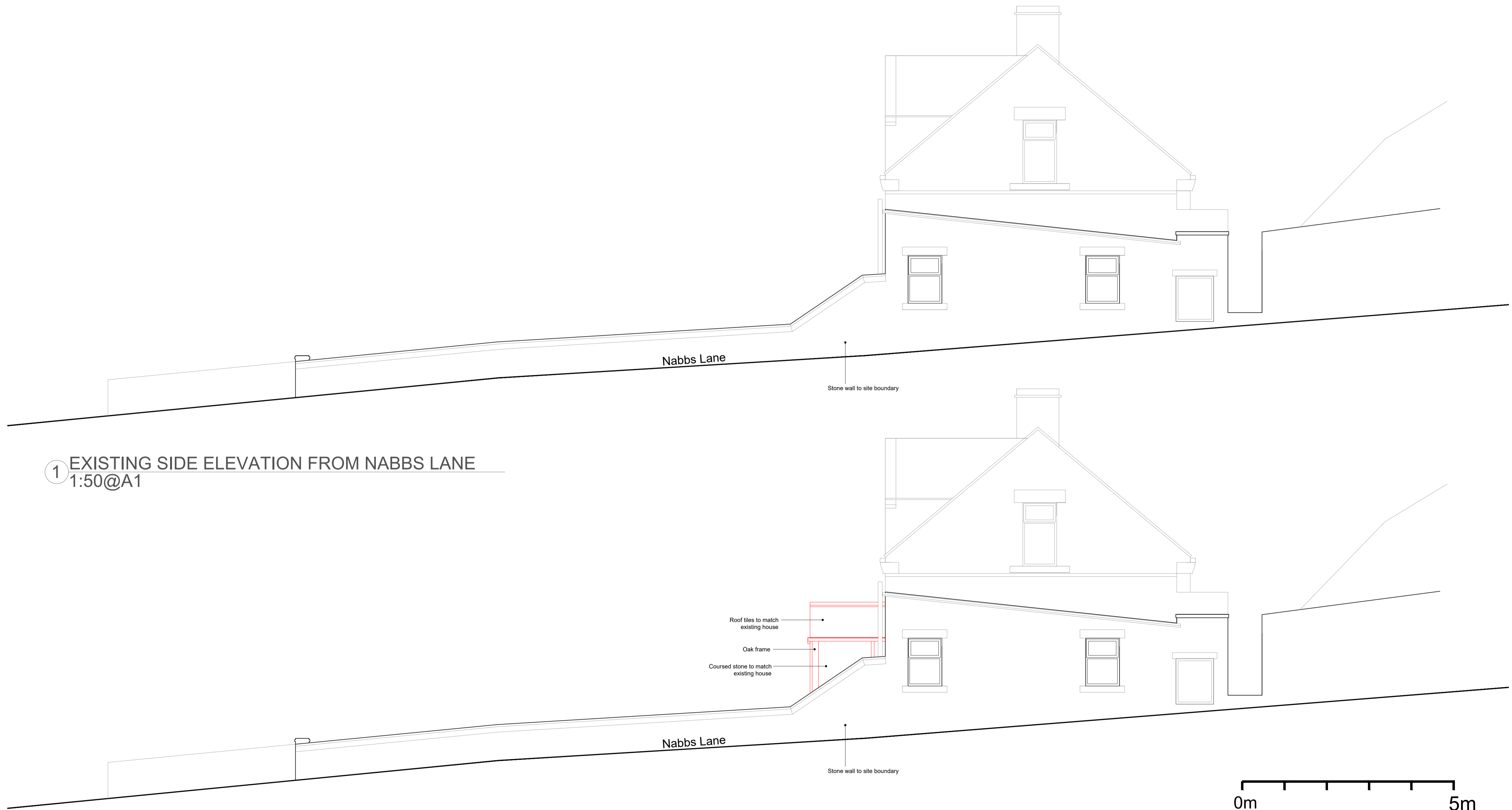
1 EXISTING SIDE ELEVATION FROM NABBS LANE 1:50@A1