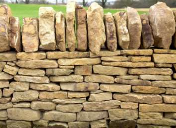
Replacement or new drystone walls to match existing utilising stone to match.