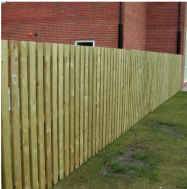
Timber hit and miss fence – 1.8m high between plot boundaries

NOTE – No highway retaining walls are proposed.