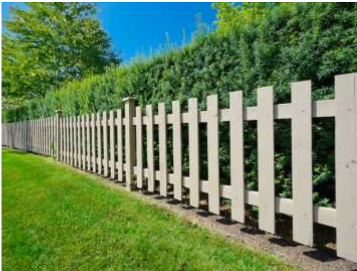
Plot boundaries adjacent new highway to receive privet hedge (or similar) with fence to rear / plot side.