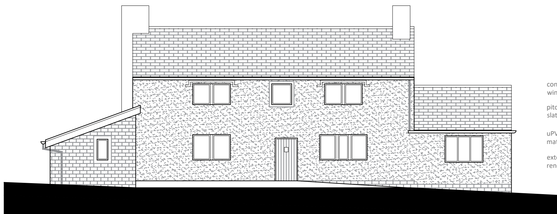
1 SOUTH ELEVATION AS PROPOSED (no change to this elevation proposed) SCALE 1:100

NOTE: THIS DRAWING HAS BEEN REPRODUCED FROM THIRD PARTY INFORMATION PROVIDED BY THE CLIENT. NORTHLIGHT ARCHITECTURE CANNOT BE HELD LIABLE FOR ANY DISCREPANCIES FOUND BETWEEN THE INFORMATION SHOWN ON THIS DRAWING AND THE PHYSICAL PROPERTIES OF THE BUILDING.