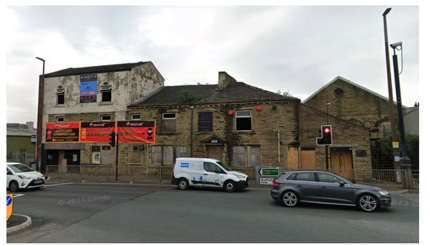
IMAGE SHOWING CONDITION OF BUILDING