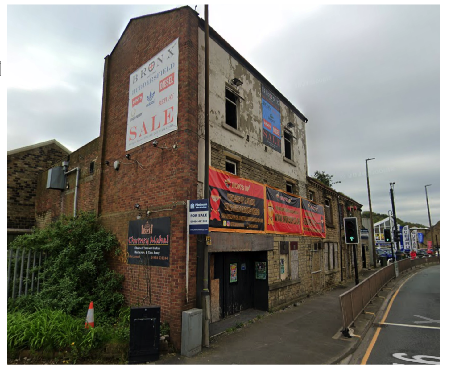
IMAGE SHOWING CONDITION OF BUILDING