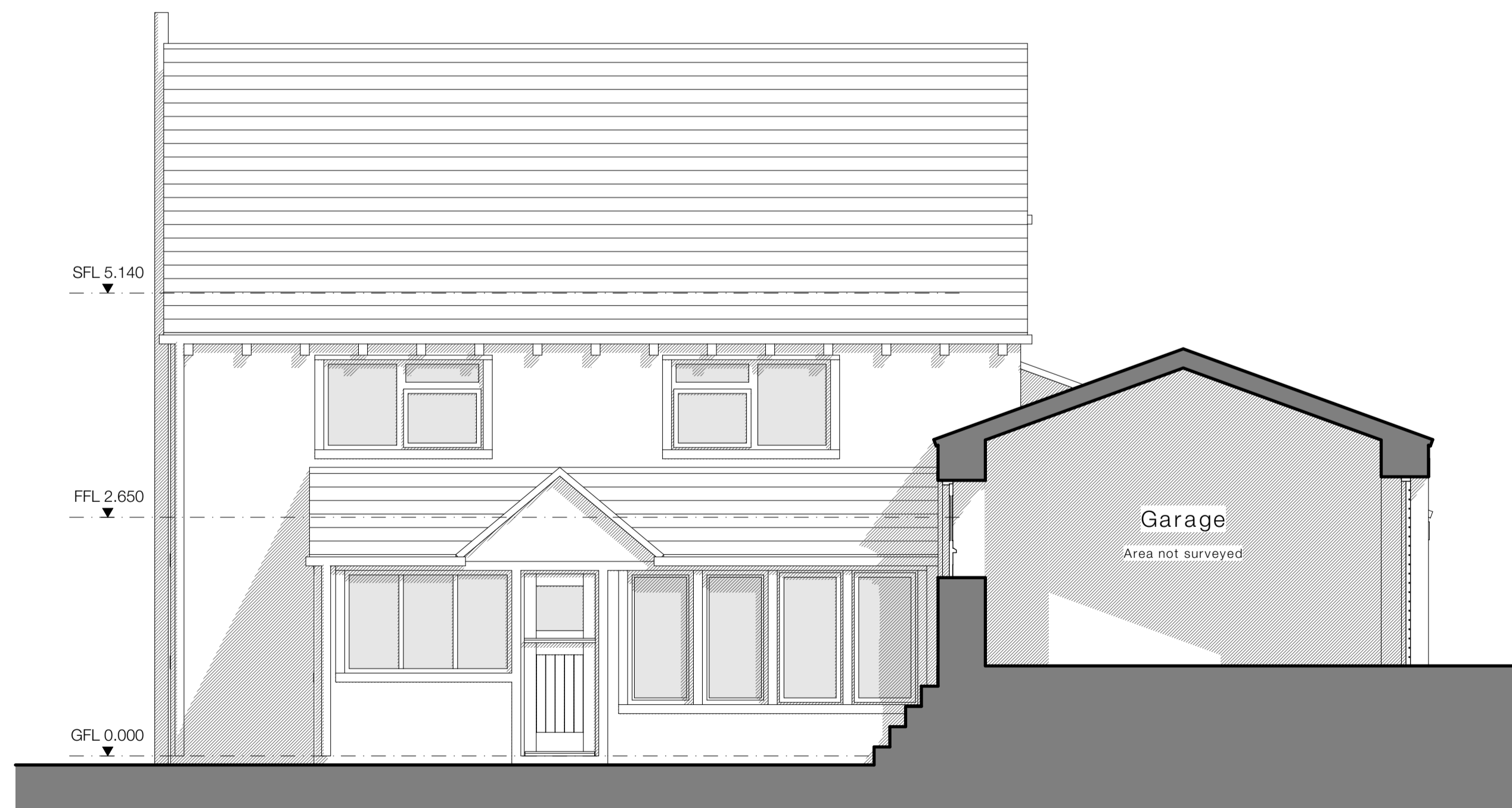
Proposed S Elevation - 1:50