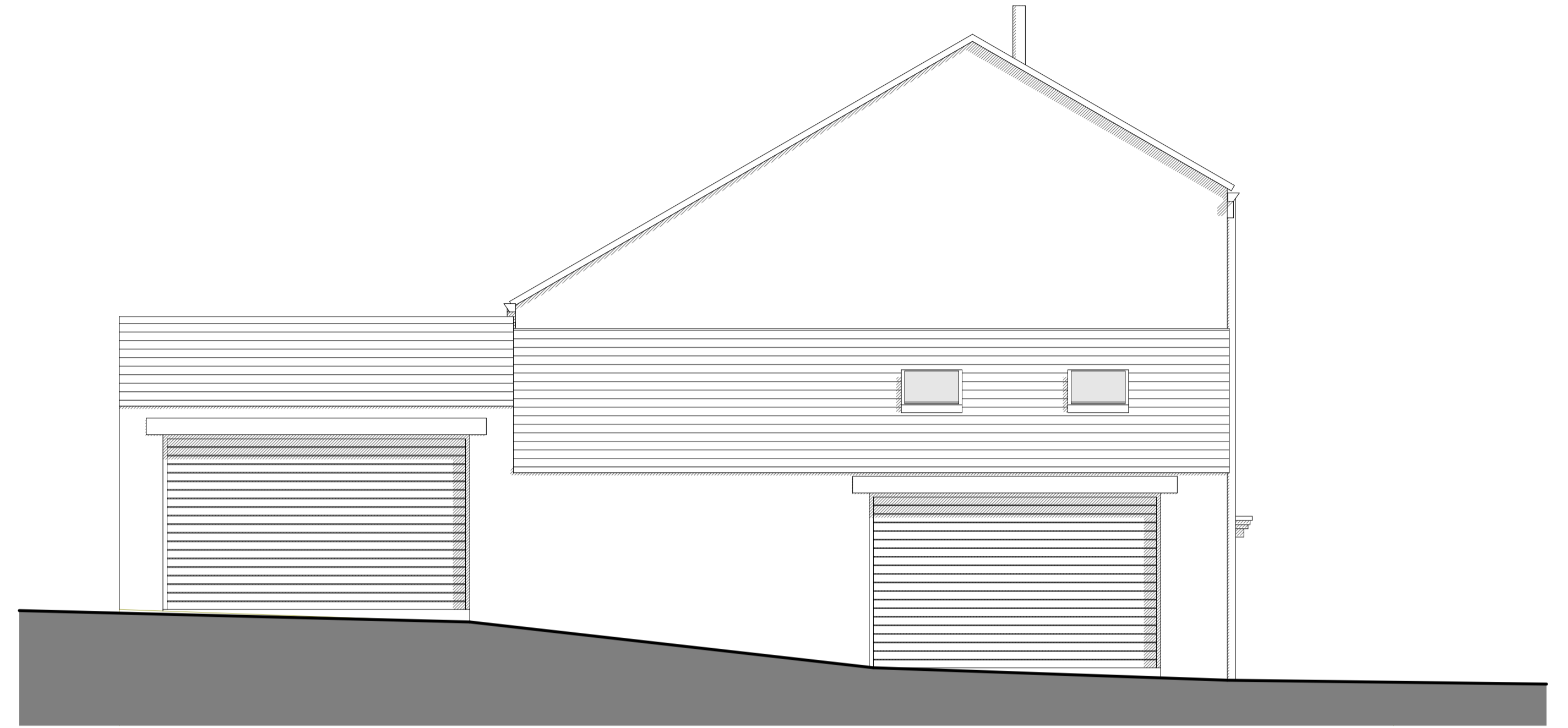
Proposed E Elevation - 1:50