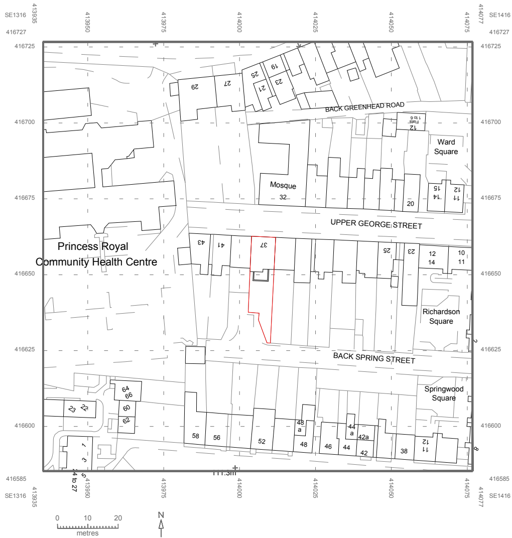
1 Site Location Plan 1-1250