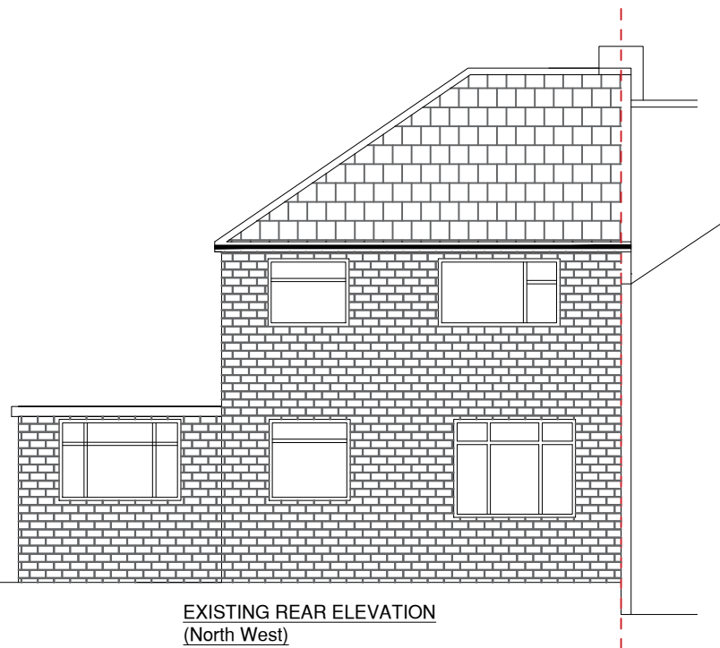
EXISTING REAR ELEVATION (North West)

PURPLE LINE SHOWS NEIGHBORING (43) PROPERTY 475mm LOWER THAN THE APPLICATION PROPERTY