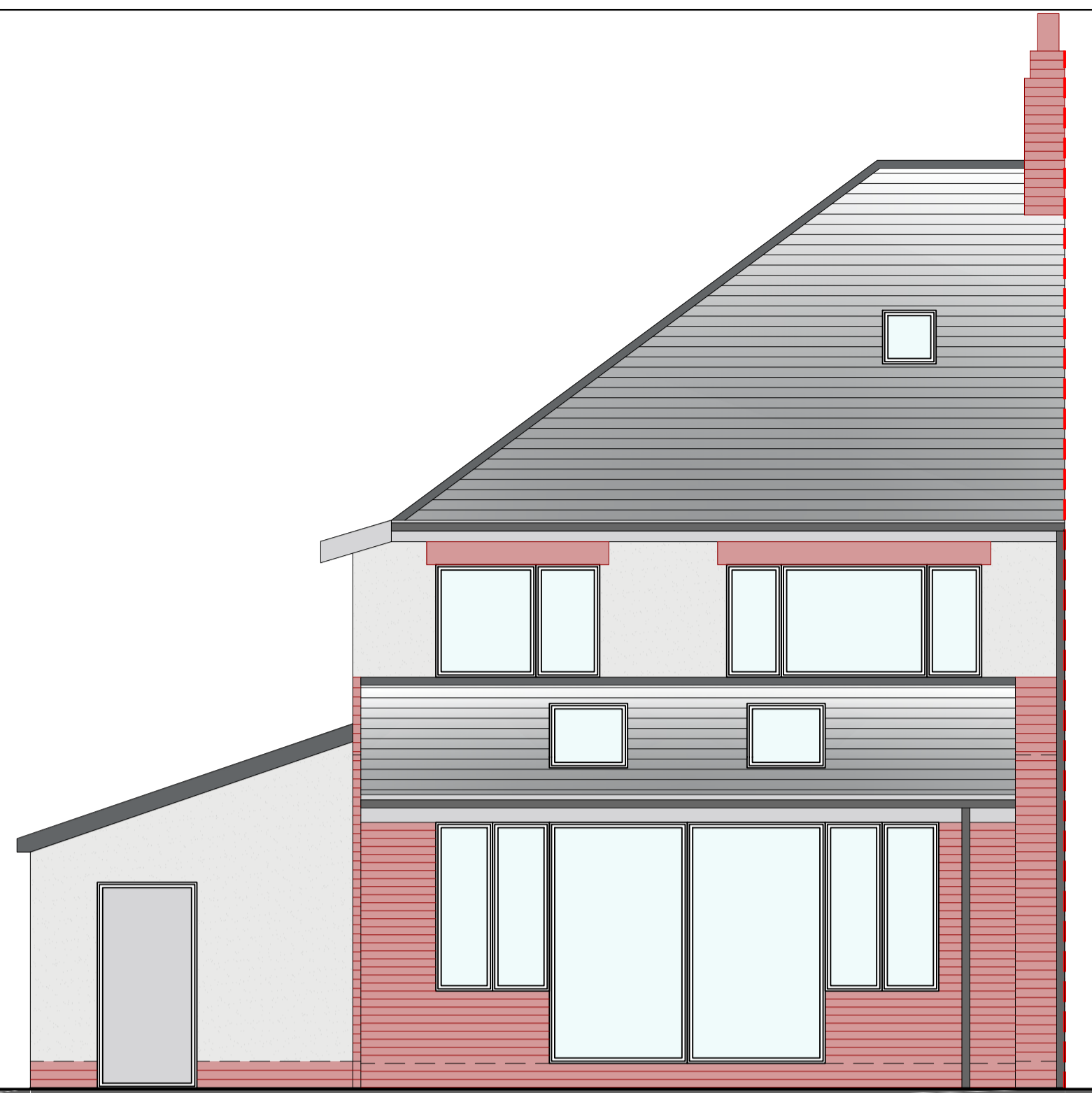
WEST ELEVATION 1:50