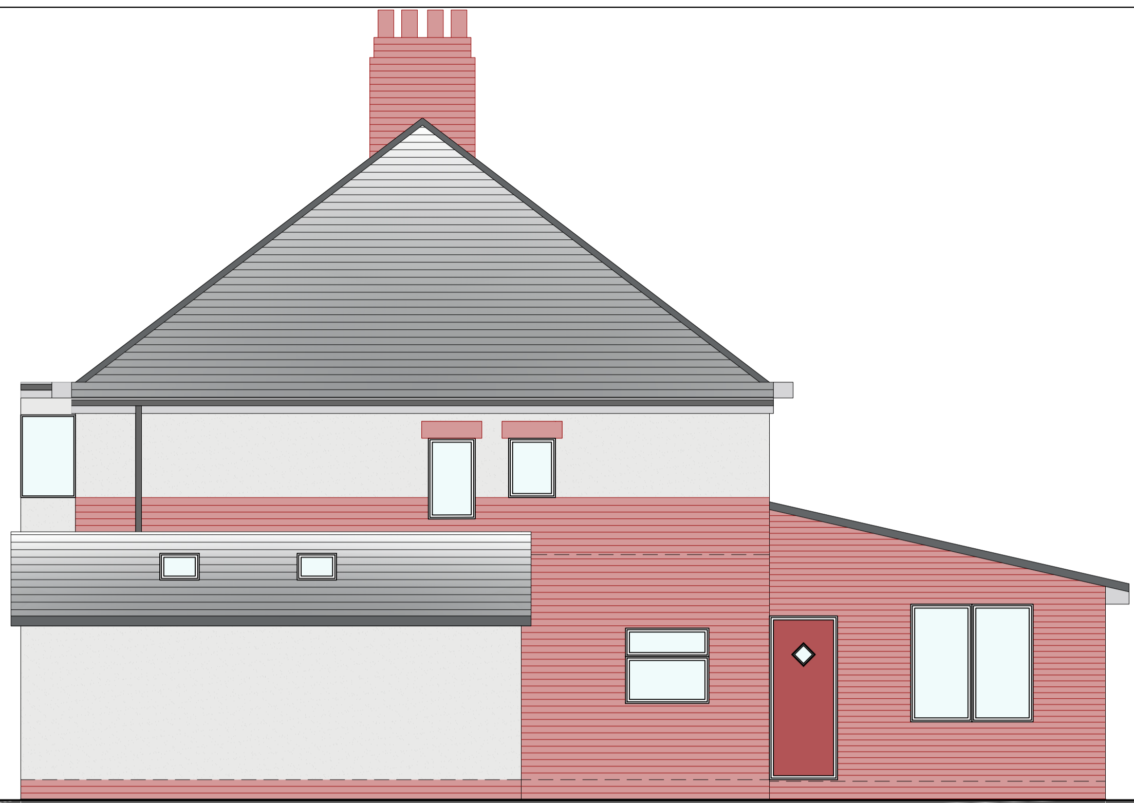
NORTH ELEVATION 1:50