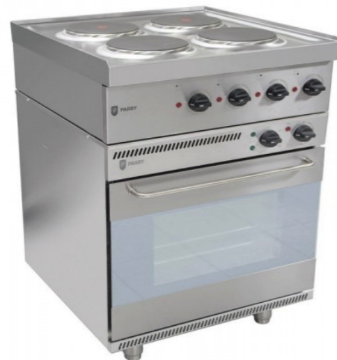
- Parry PEO1871 Electric Oven with Four Hob Fitted Top