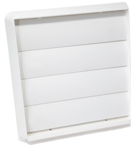
- Example of extract grille. Approx size: 150x150mm