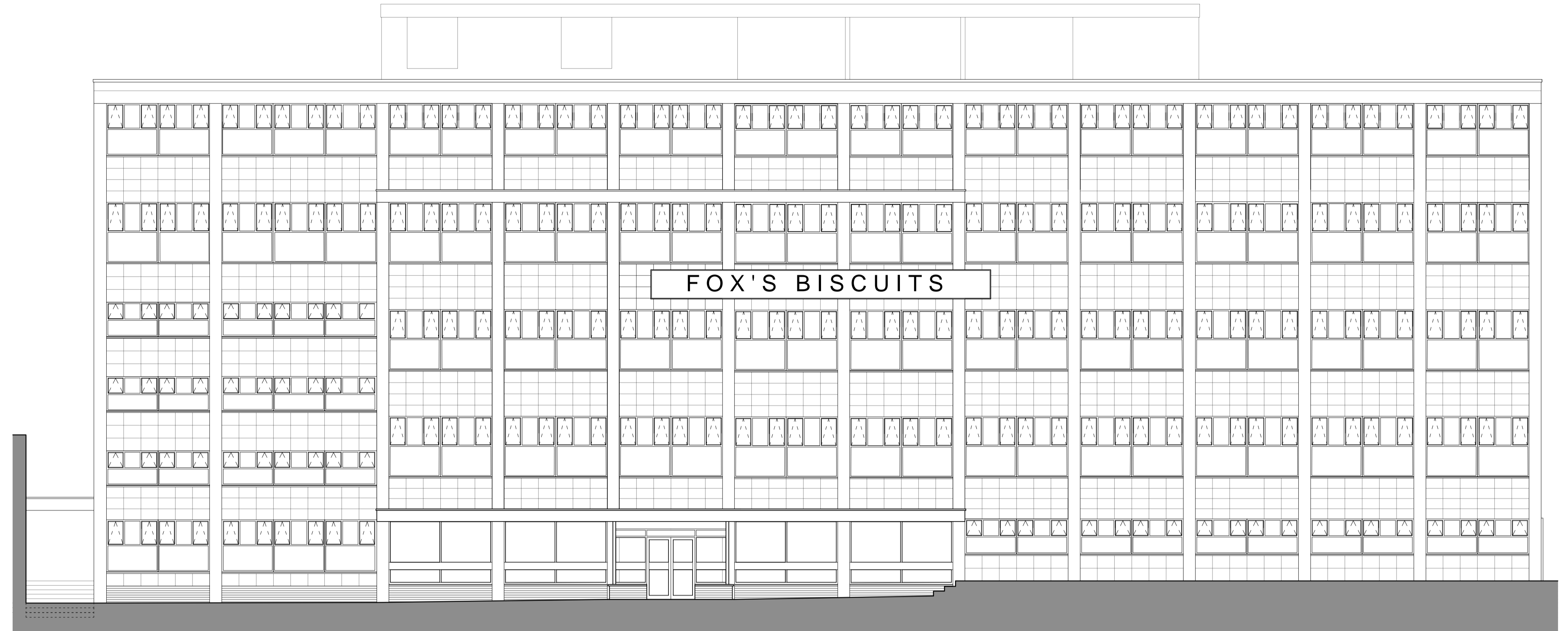
NORTH ELEVATION AS PROPOSED