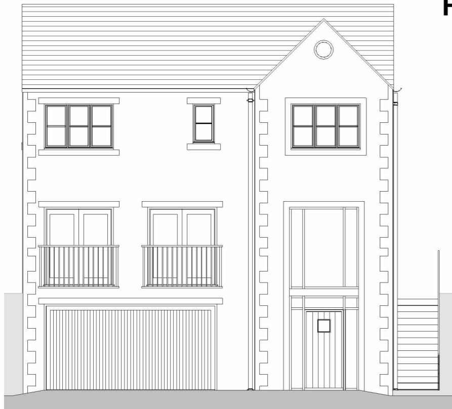
Front elevation 1 : 100