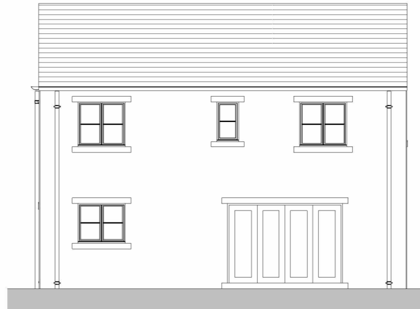
Rear elevation 1 : 100

Please refer to drawing 8834-BOW-A0-ZZ-DR-A-0111 for external facade materials