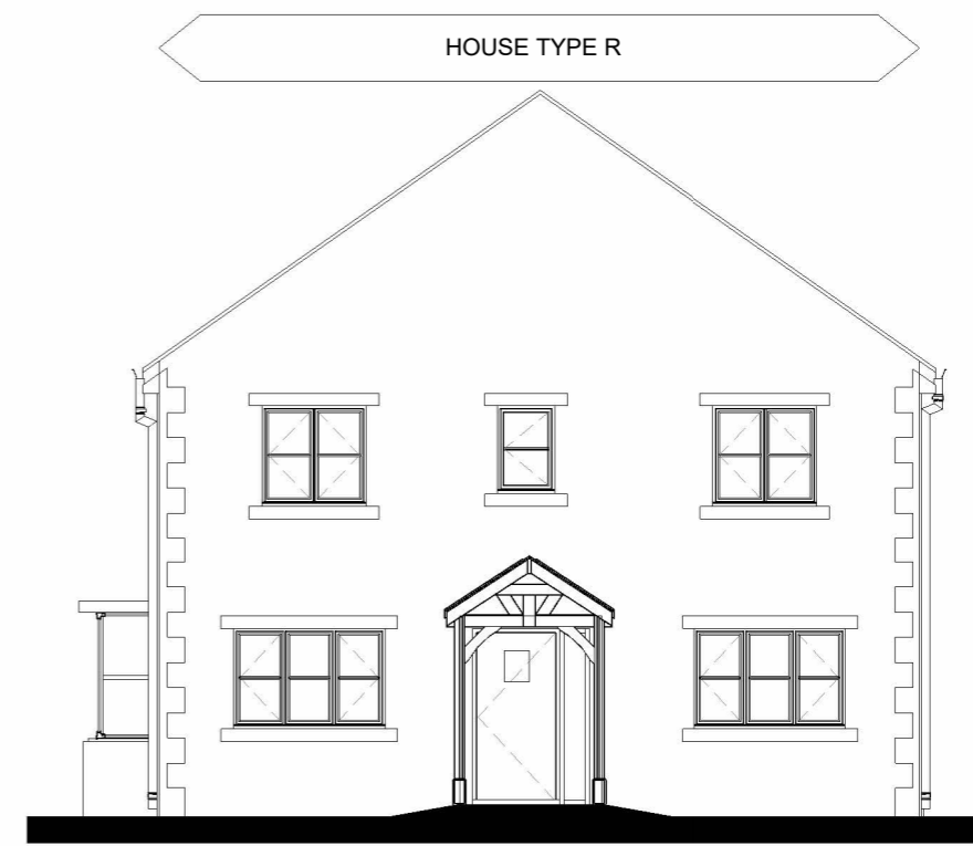
Side elevation 1 : 100