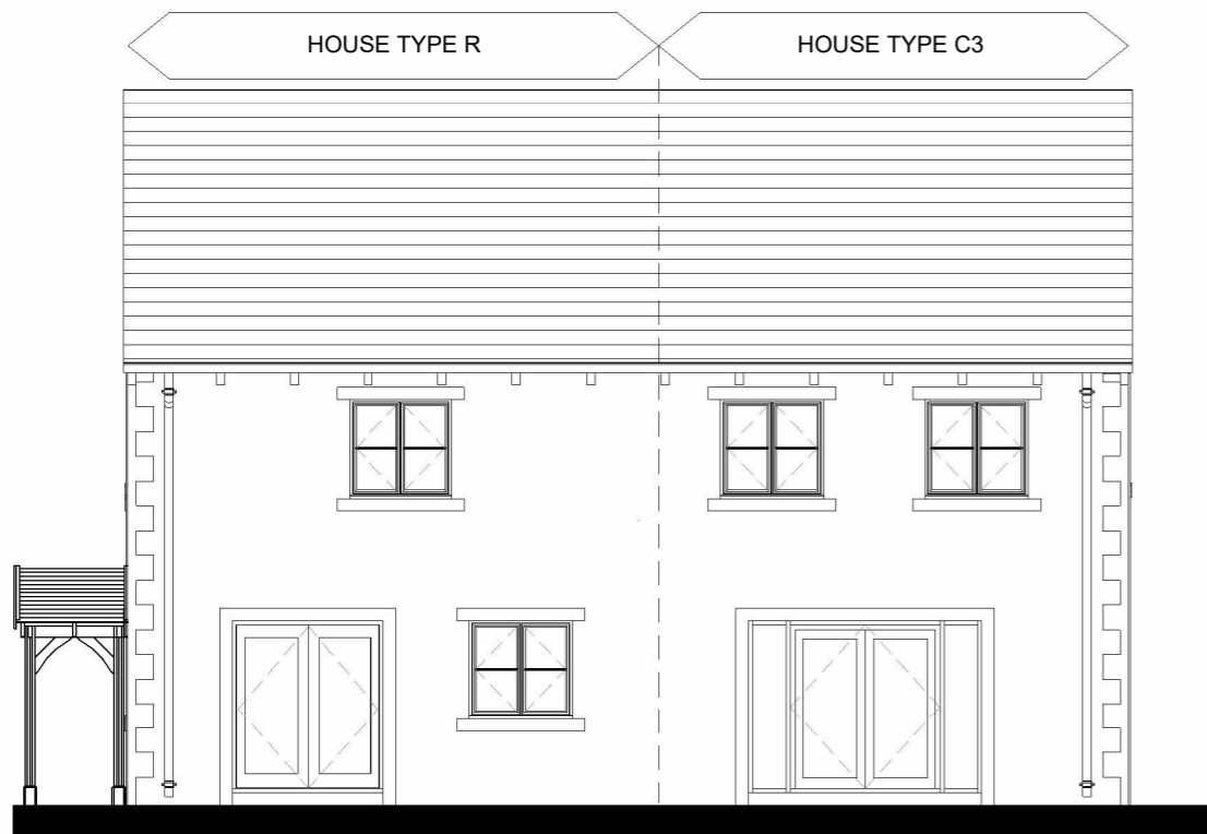
Rear elevation 1 : 100