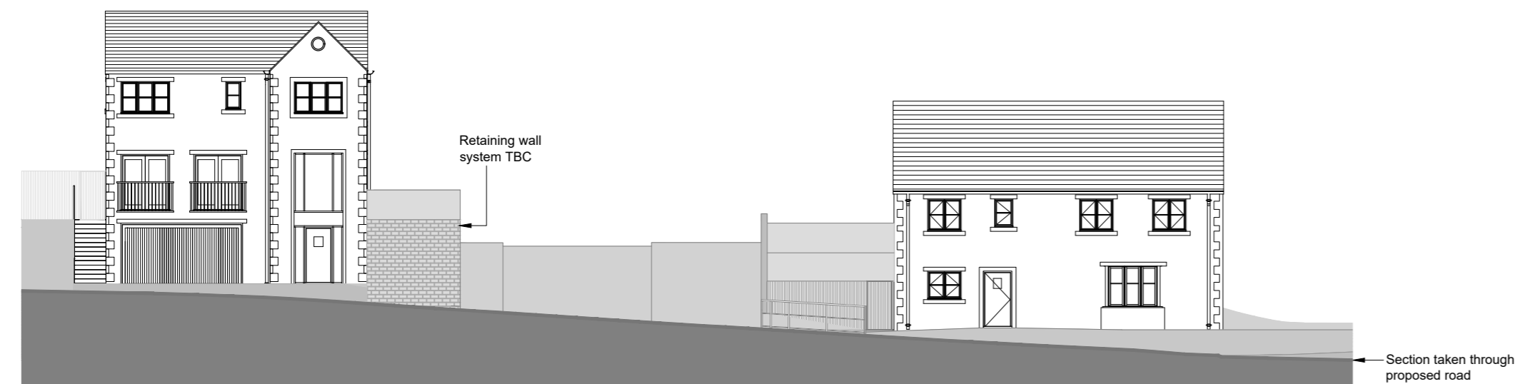
Section C - C 1:200