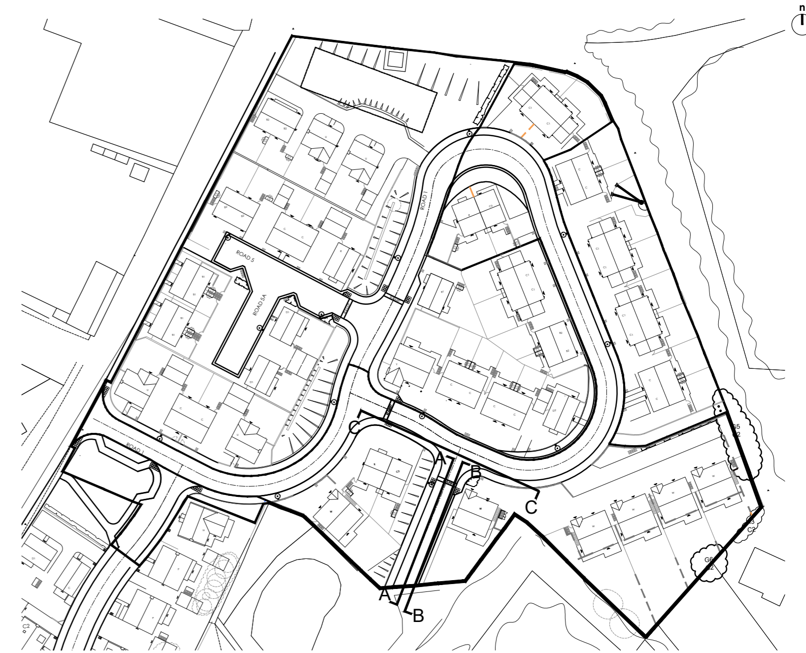
Site Plan key 1:1000