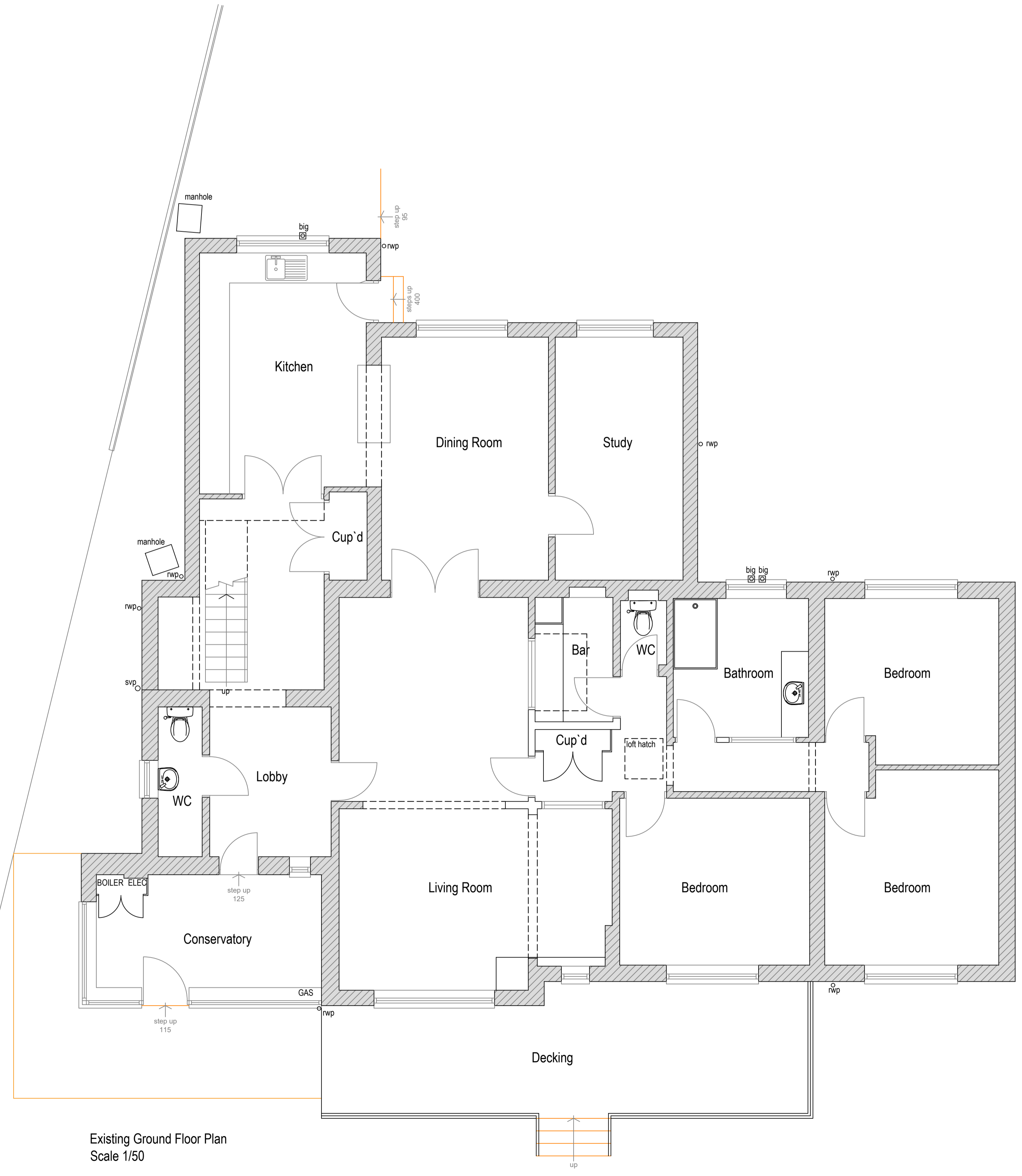
Existing Ground Floor Plan Scale 1/50