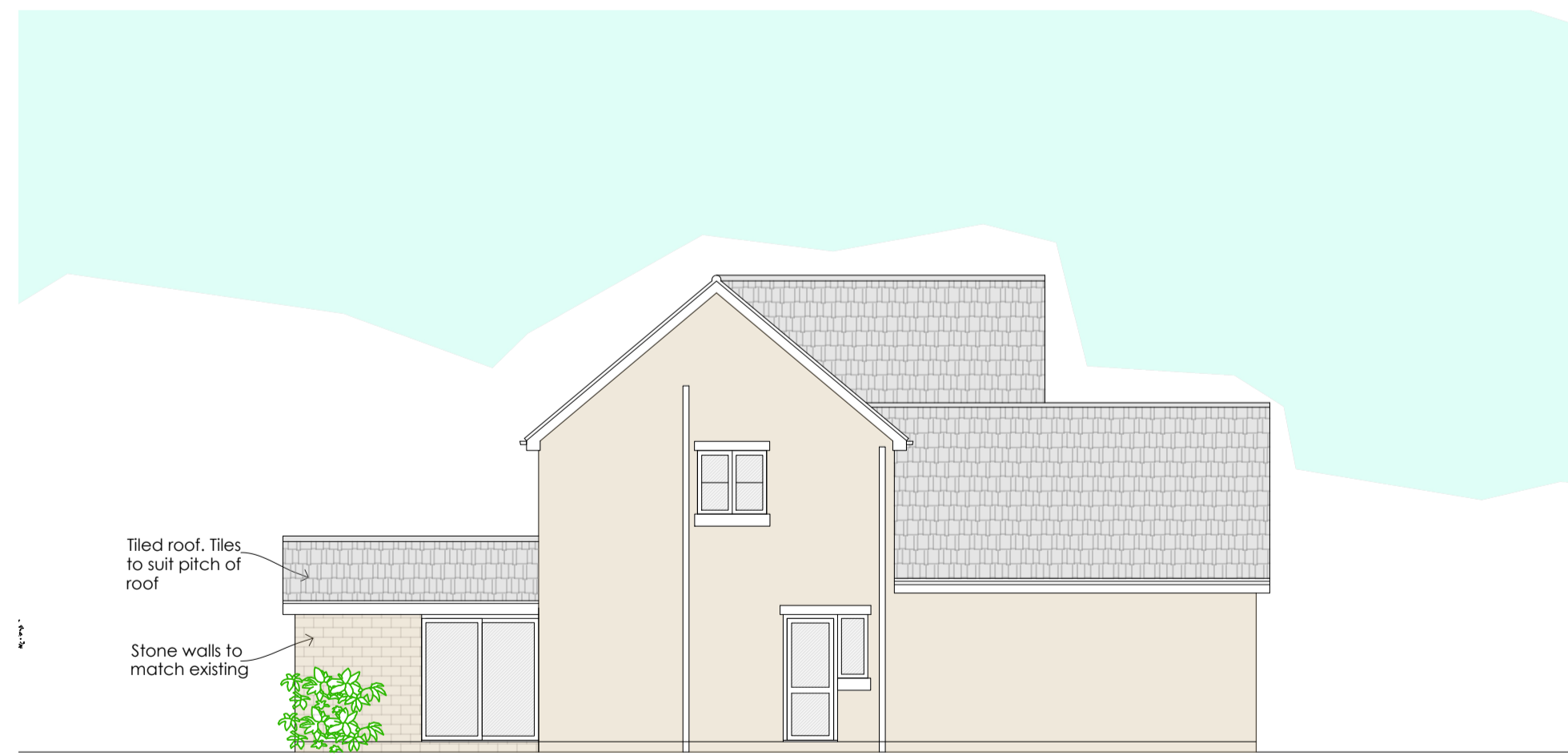
Side South West Facing Elevation