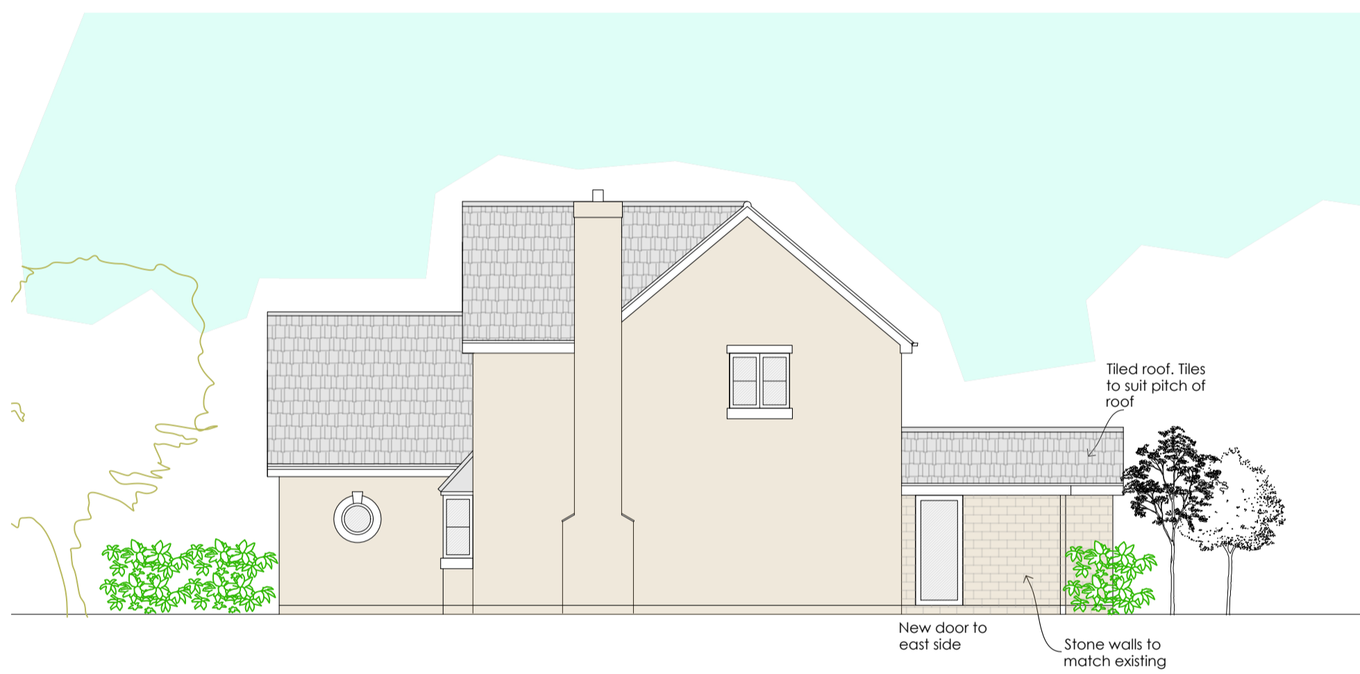
Side North East Facing Elevation