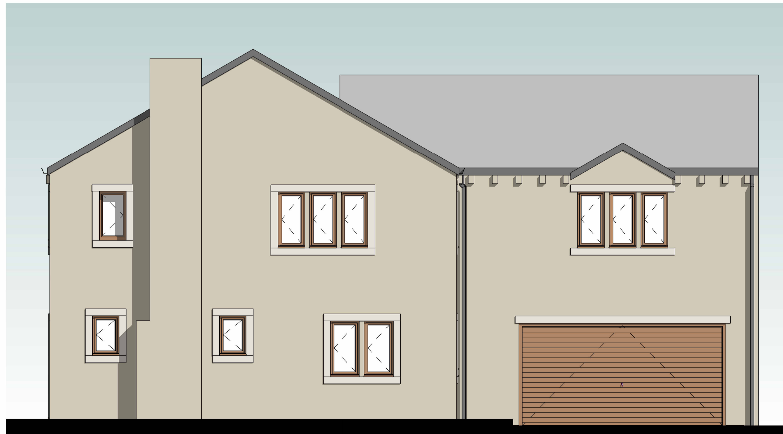
3 Ext. North Elevation (Side) 1 : 50