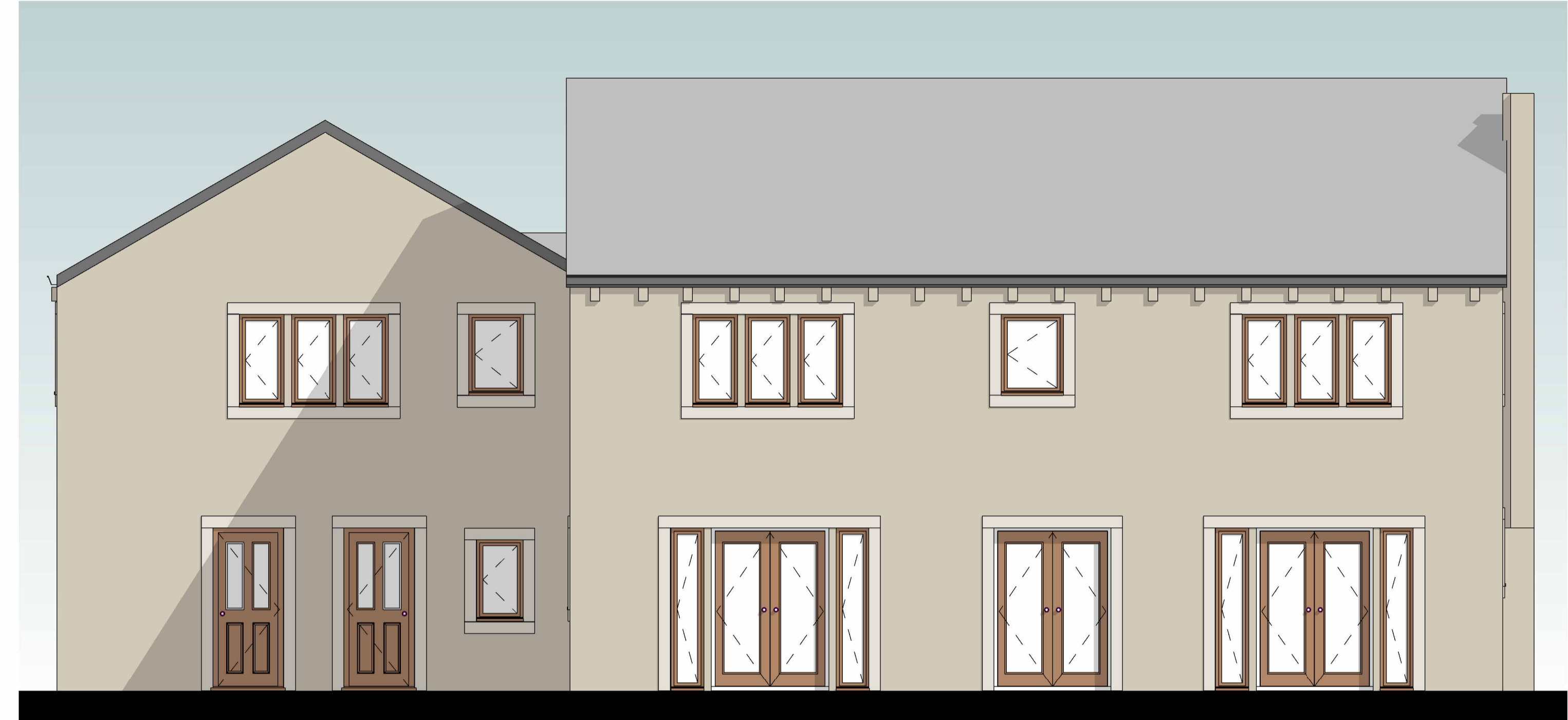
2 Ext. East Elevation (Rear) 1 : 50