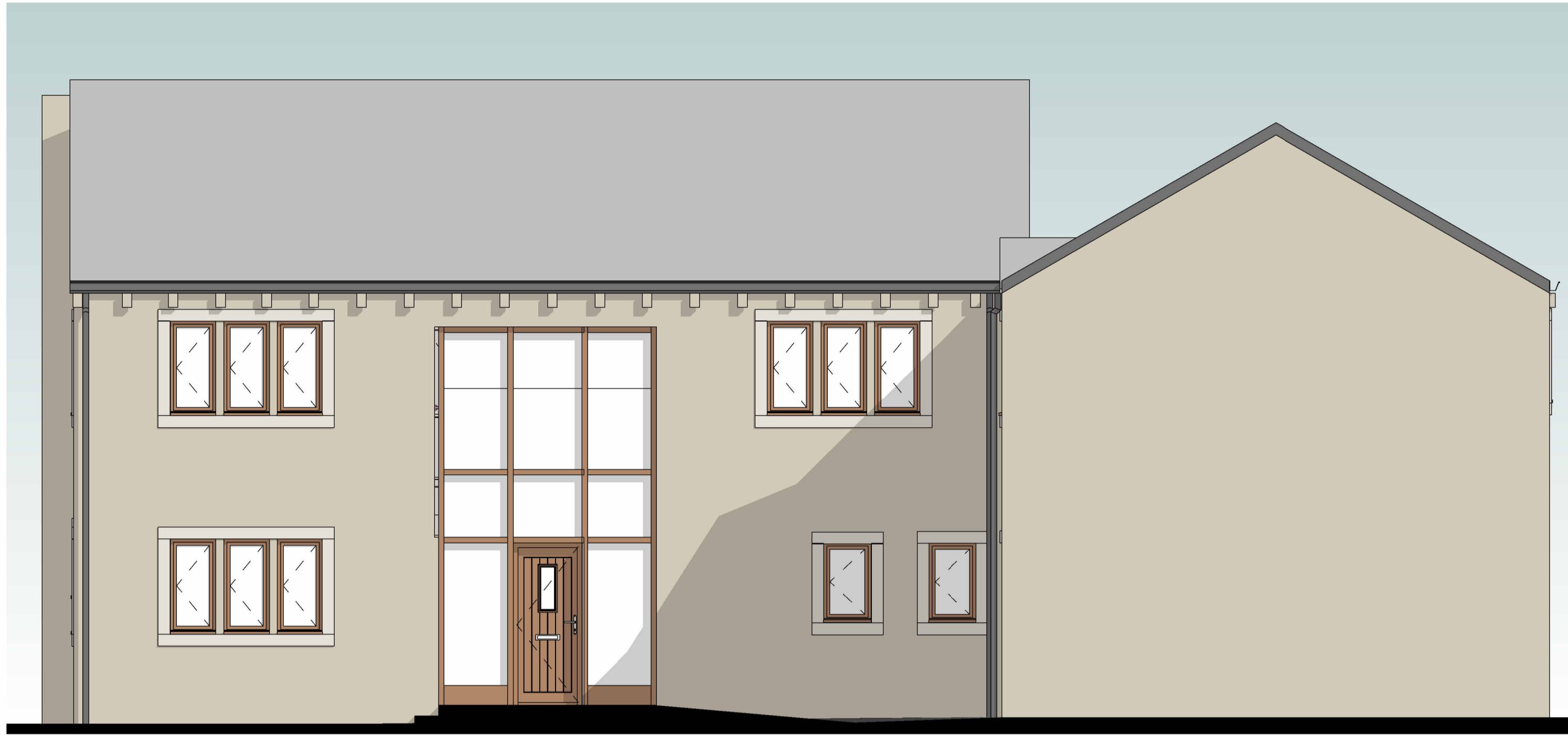
1 Ext. West Elevation (Front) 1 : 50