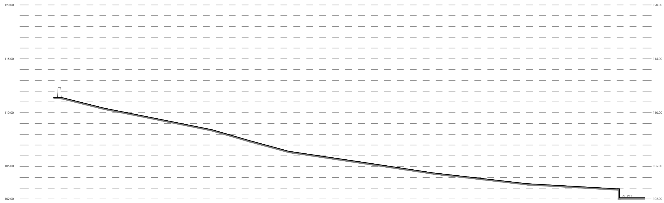
SITE SECTION - EXISTING