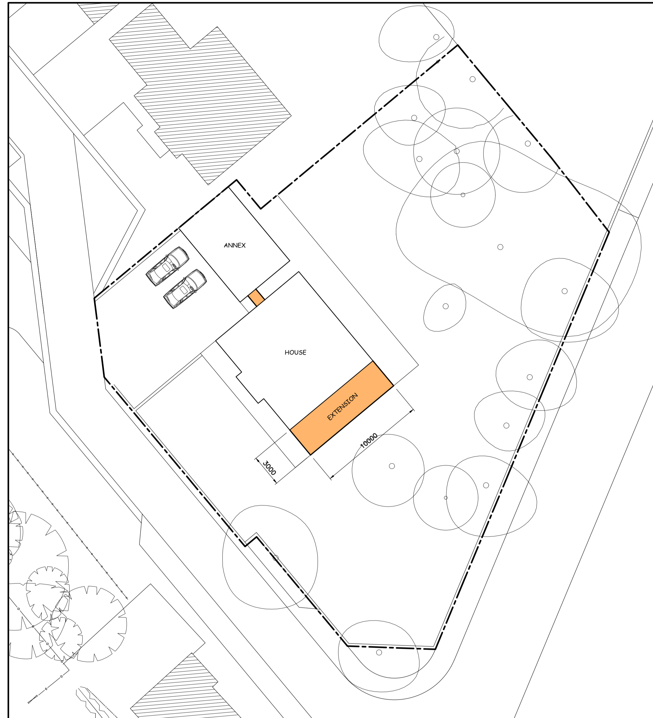
PROPOSED SITE PLAN (1/200 SCALE)