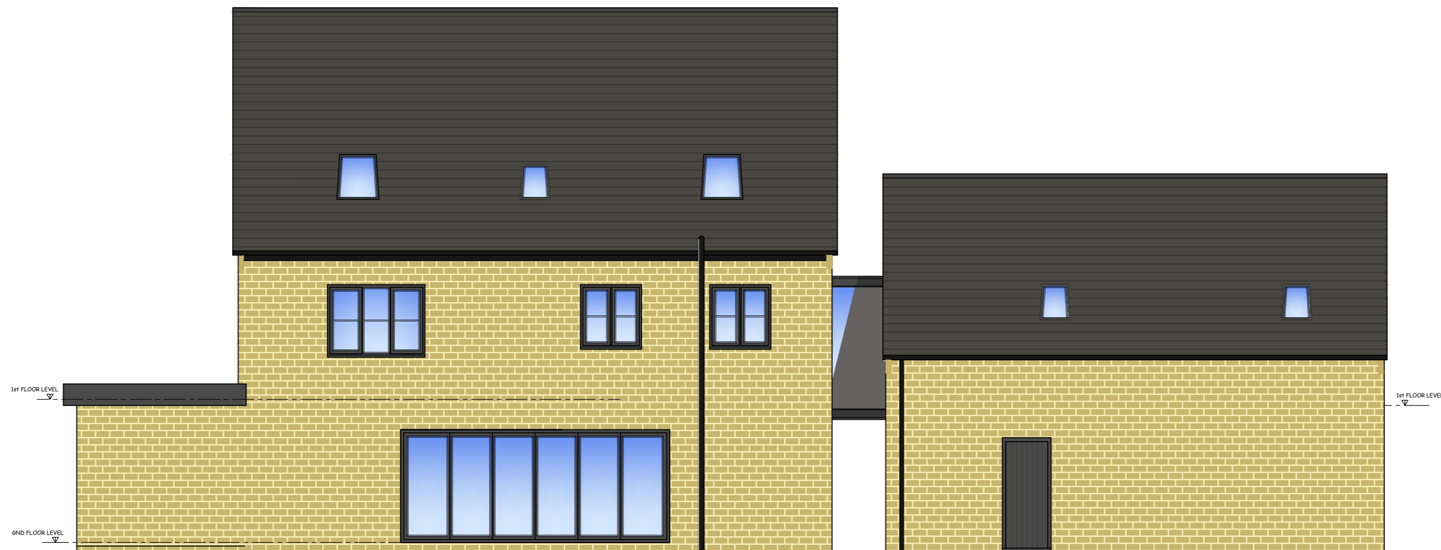
PROPOSED REAR ELEVATION (1/50 SCALE)