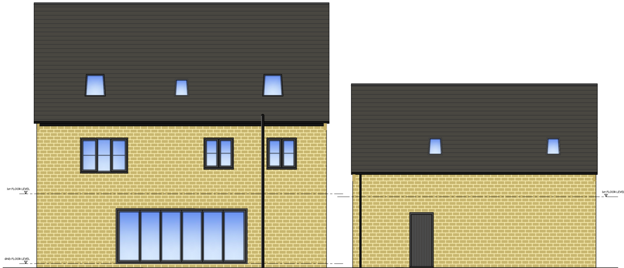
EXISTING REAR ELEVATION (1/50 SCALE)