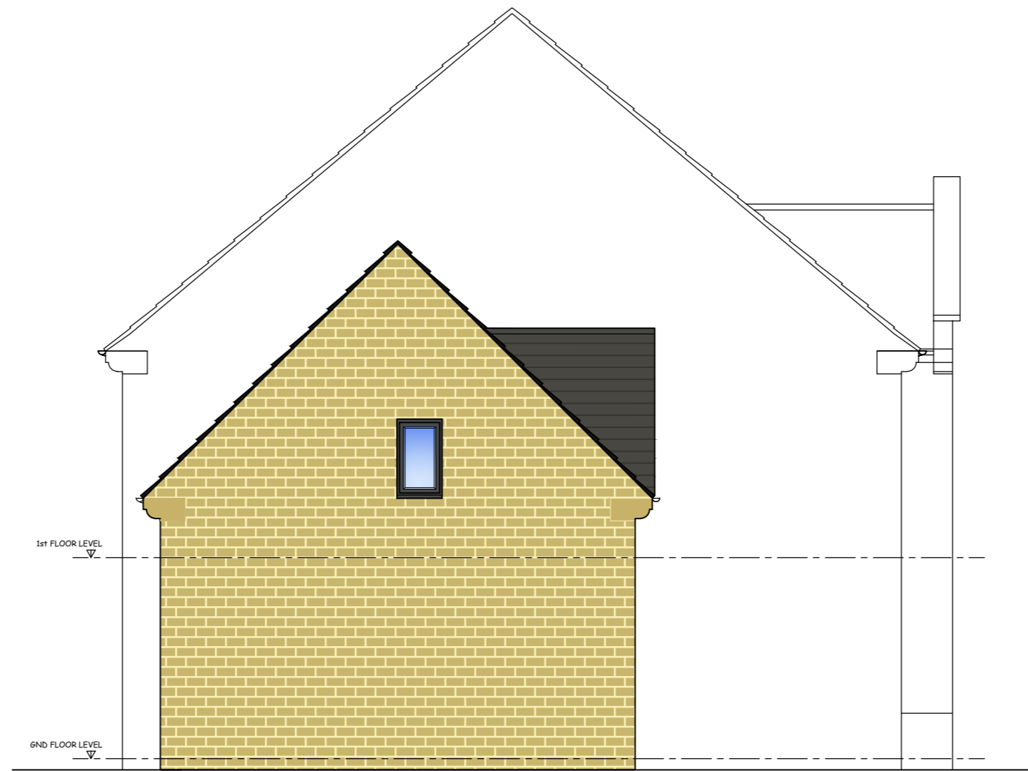
EXISTING SIDE ELEVATION (1/50 SCALE)