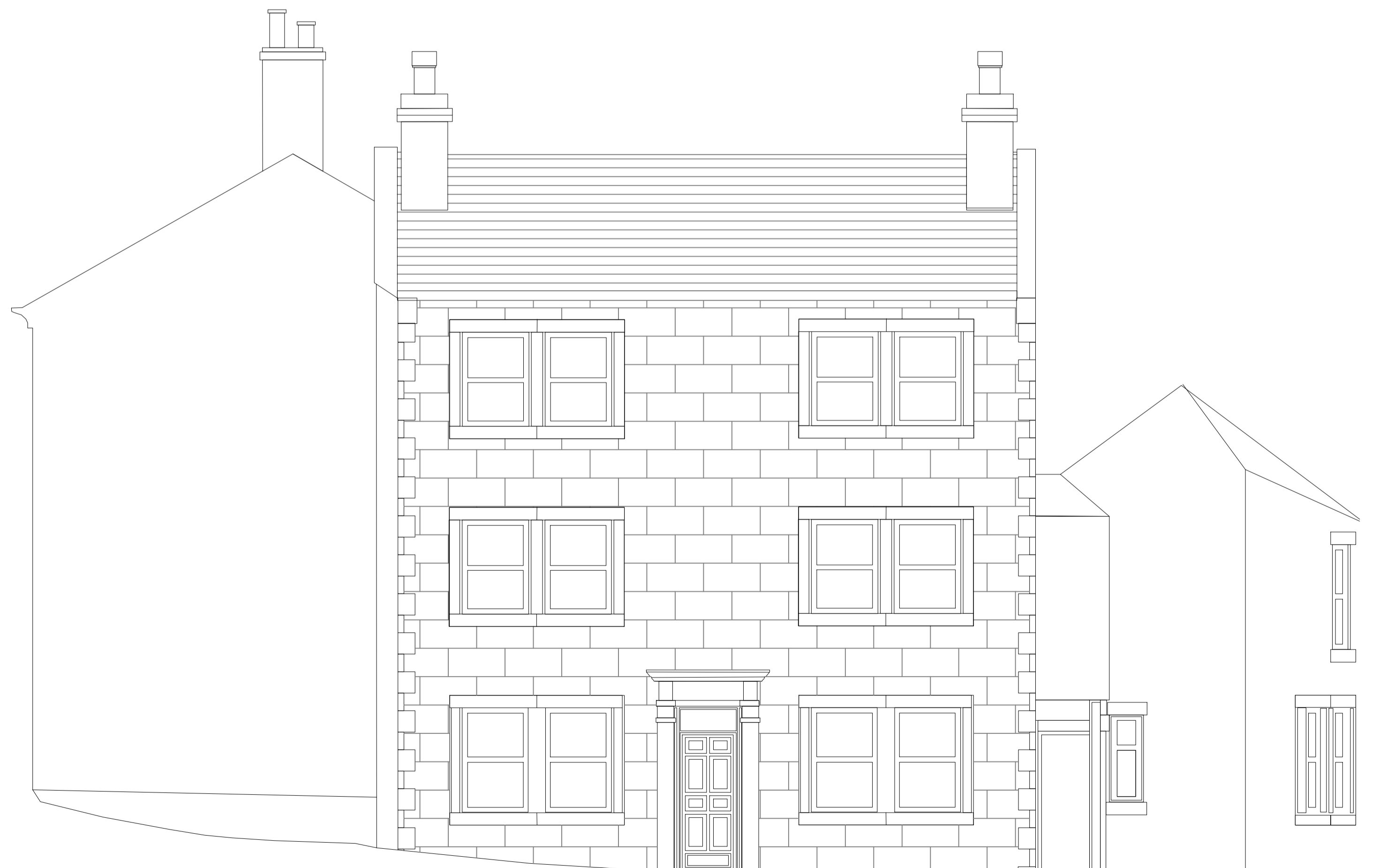
Existing Front Elevation B:B Scale 1:50