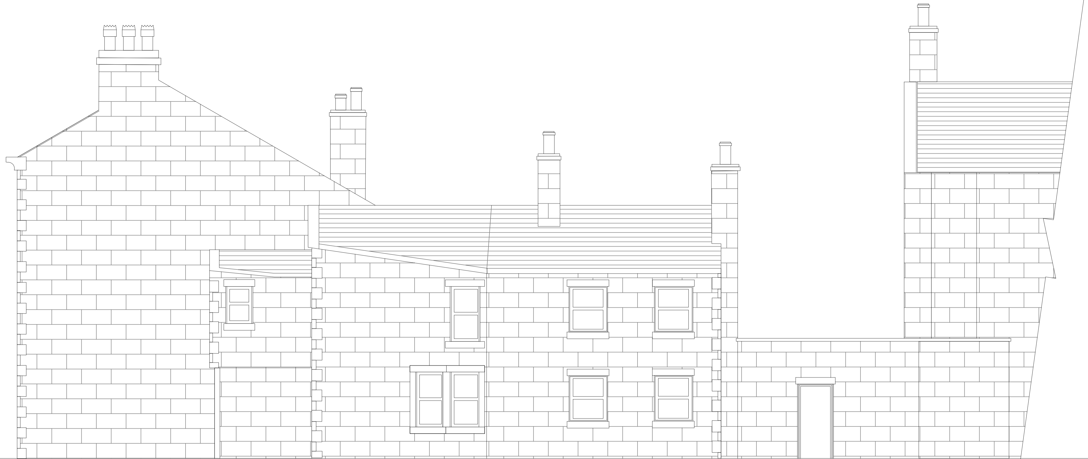
Existing Side Elevation A:A Scale 1:50