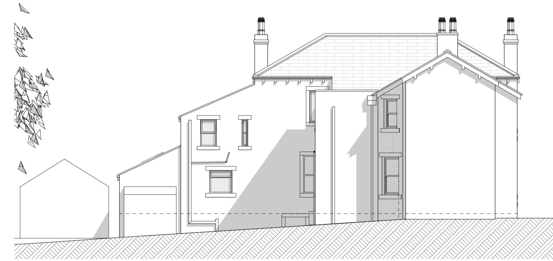
North West Elevation 1:100