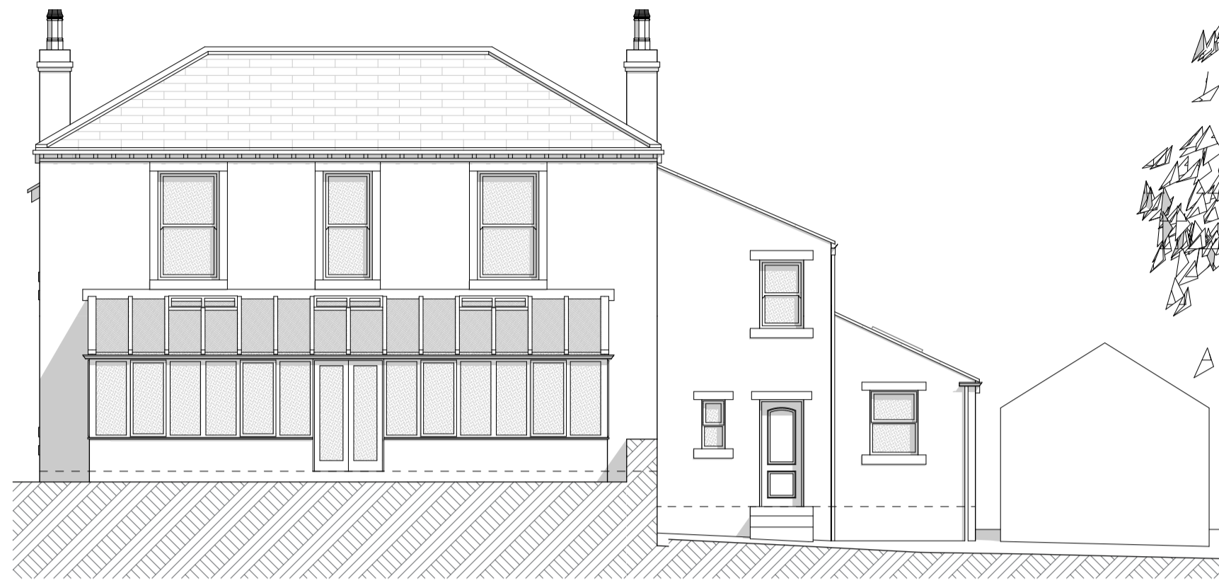
South East Elevation 1:100

THIS DRAWING HAS BEEN PREPARED FROM HAND MEASURED SURVEY INFORMATION AND IS FOR INFORMATION PURPOSES ONLY. DO NOT SCALE FROM DRAWING. USE FIGURED DIMENSIONS ONLY. ALL DIMENSIONS MUST BE CHECKED AND VERIFIED ON SITE PRIOR TO COMMENCEMENT OF WORK AND DESIGNER TO BE NOTIFIED OF ANY DISCREPANCIES.