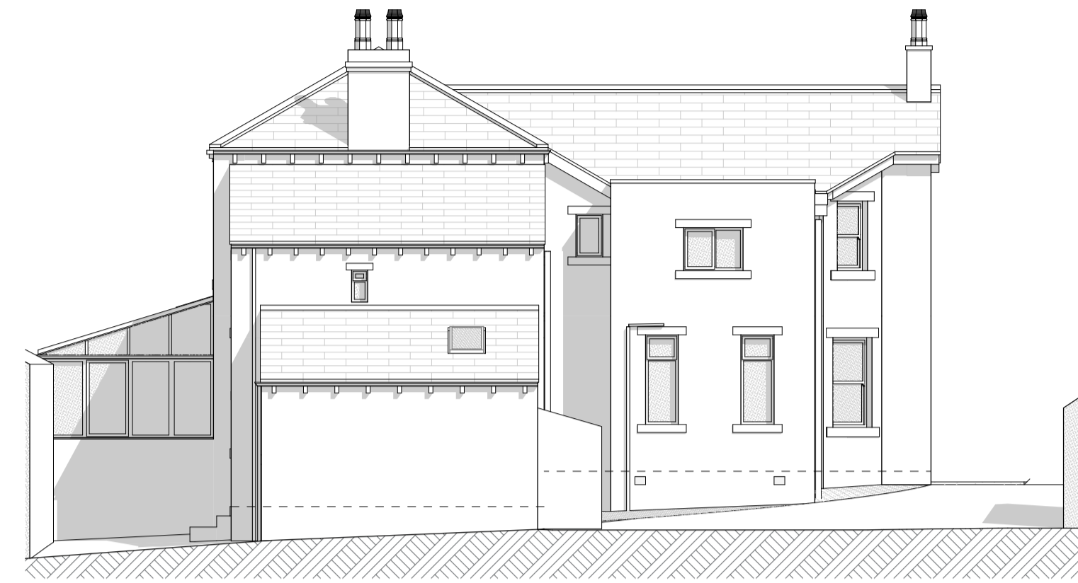
North East Elevation 1:100